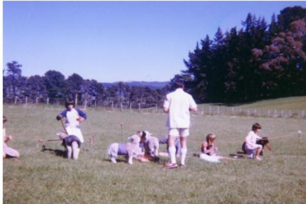
Pet Day 11/11/85