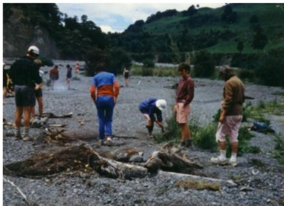
Makaroro—Outdoor riverbed cooking