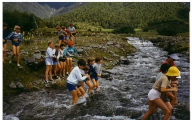
River Crossing—Triplex Creek