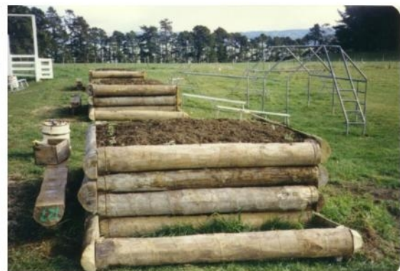
Tree felling in front of senior room, July 1985. Tree Bays planted and garden retainers attached.