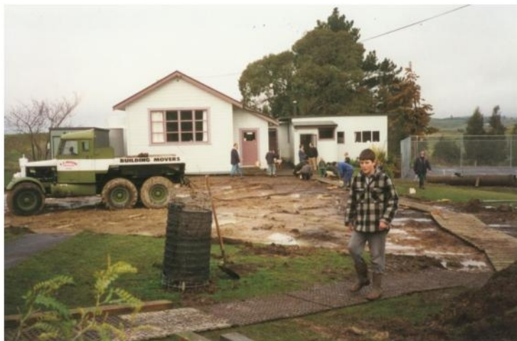
Classroom on the move to Sherenden School, late 1996