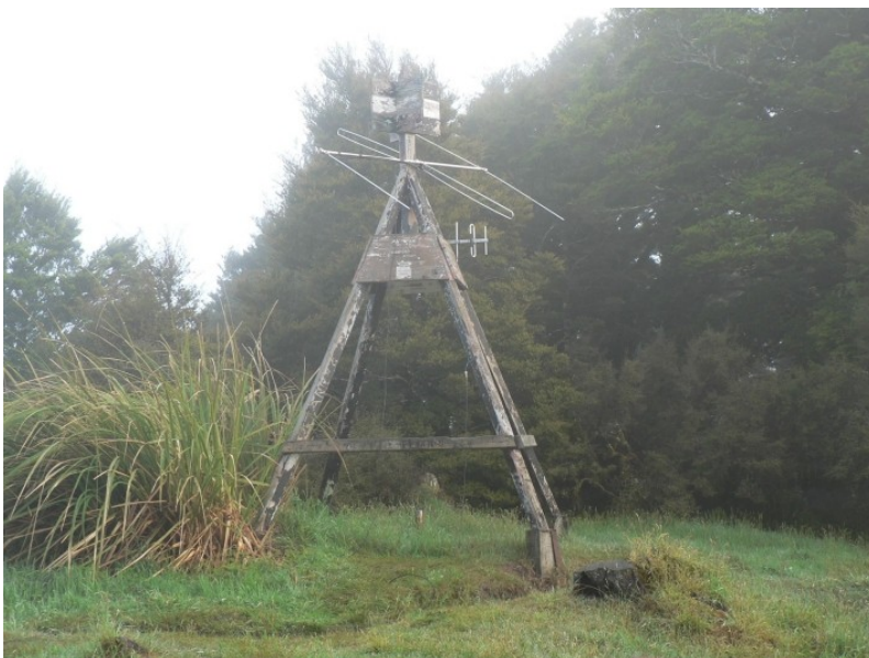
The antenna on the temporary mast