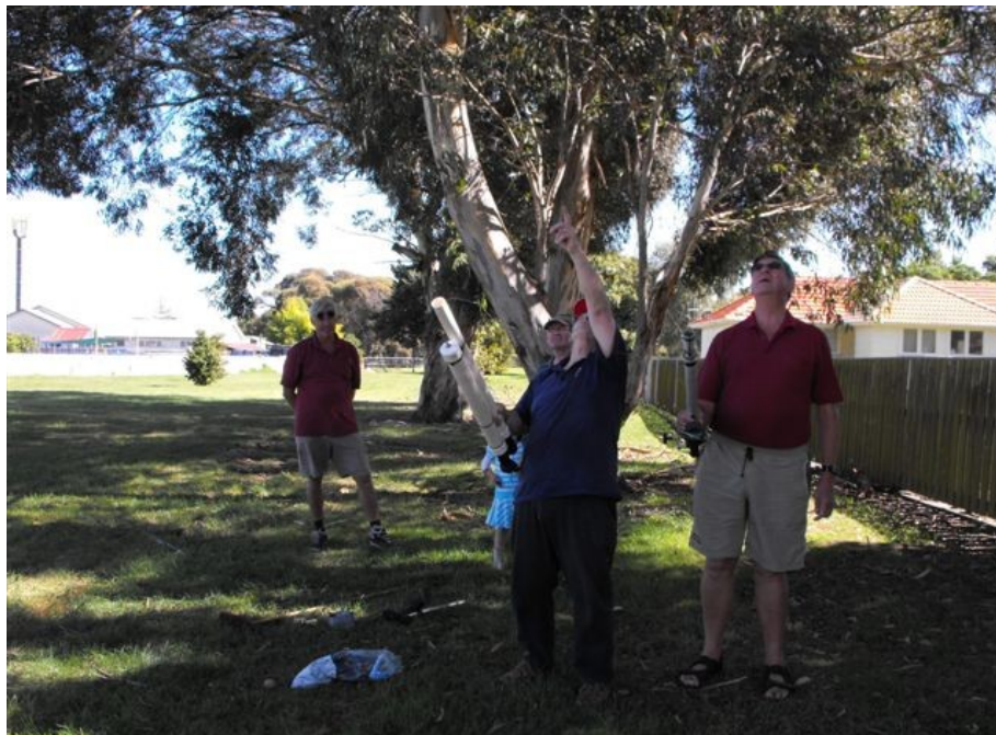
Planning the projectile direction.