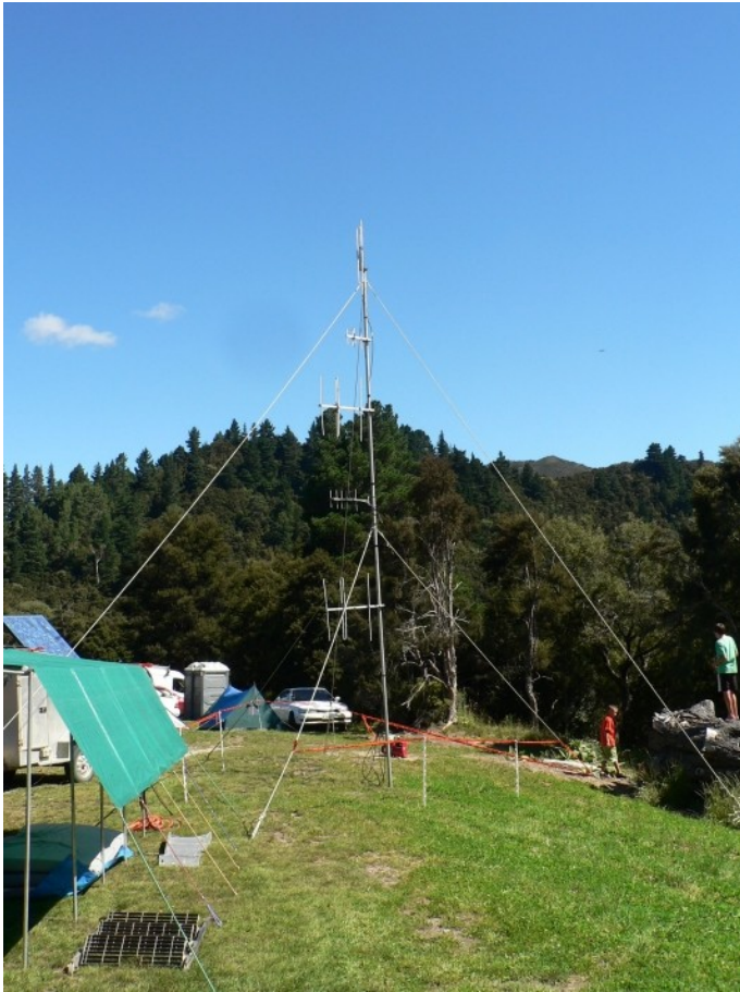
Two views of the mast and antennae