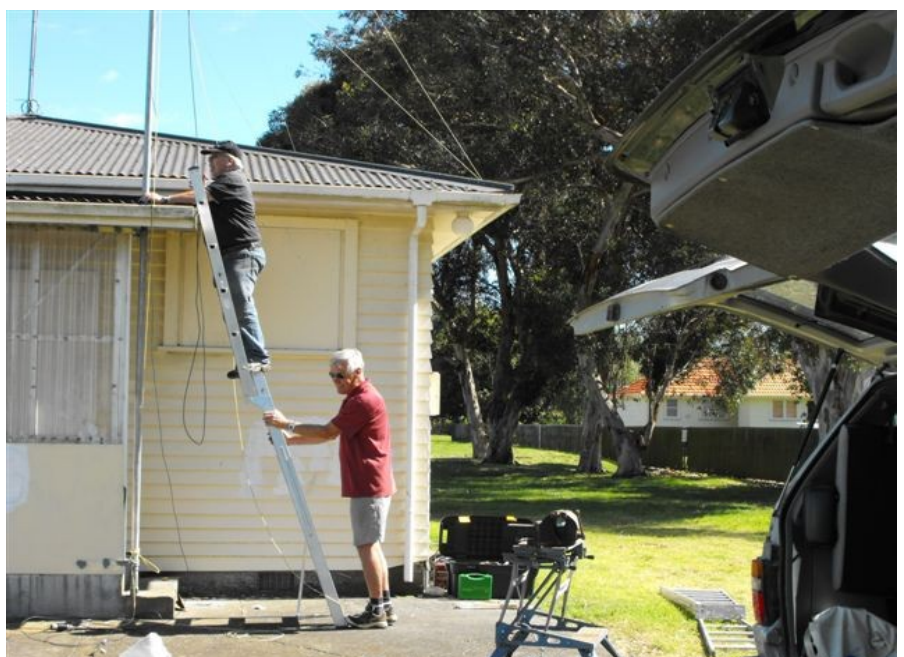
Tying off the halyard ... job nearly done.