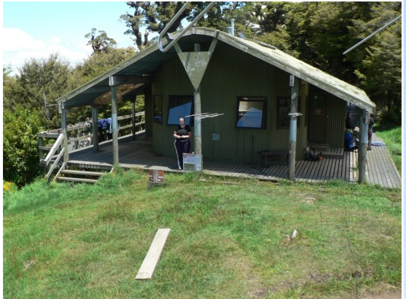
ZL2QC Taking a break