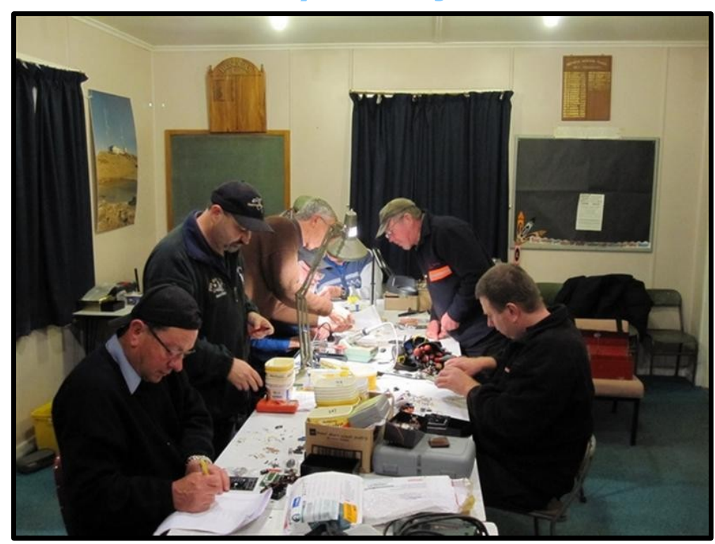
Digimode Project 2009

Napier Club Antenna Analyser Project 2009