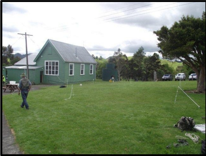
A picture showing the Headquarters building and including our "ground loop" antenna designed for close HF work. This is a day frequency aerial