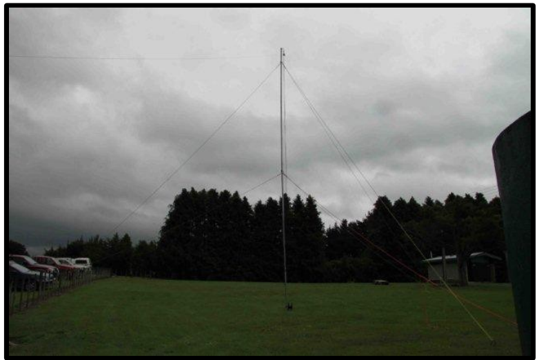
The mast with the inverted V night antenna