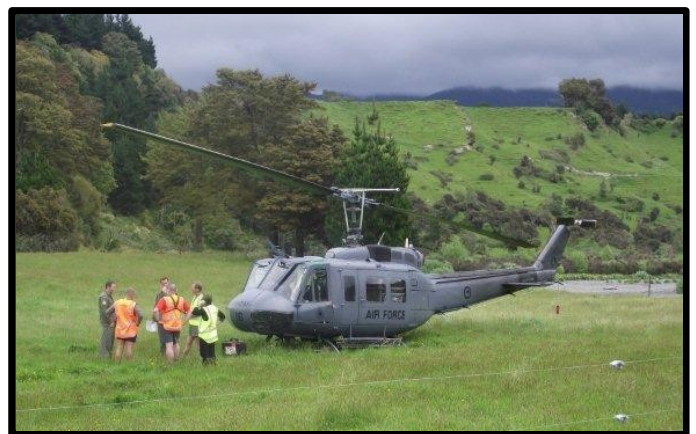
Discussing the tasking with the helicopter crew