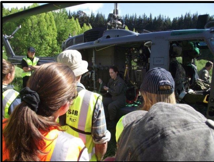
The helicopter crewman briefing on winching. This has to be renewed every 12 months. It is our responsibility to place the VHF repeaters on hilltops and often the only way to get there is by helicopter