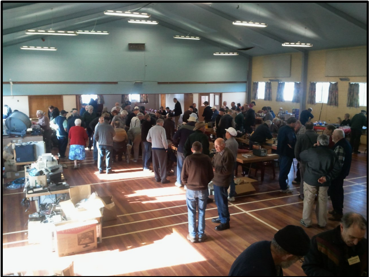
The Manawatu Table sale – an annual tradition for a number of the members from our two branches