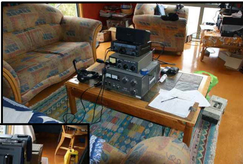
The doublet station