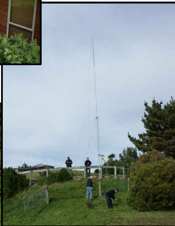
The 190ft doublet centre support is up