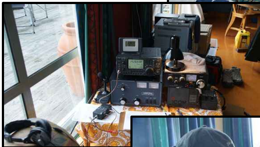
The beam station