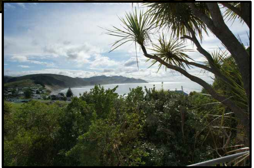
The view from the QTH