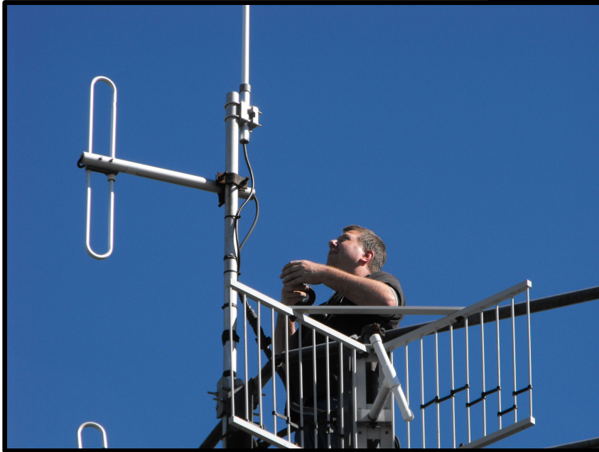
Z12AJ doing the deed