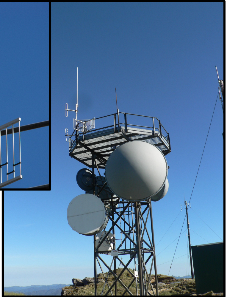
The full array in all it's glory