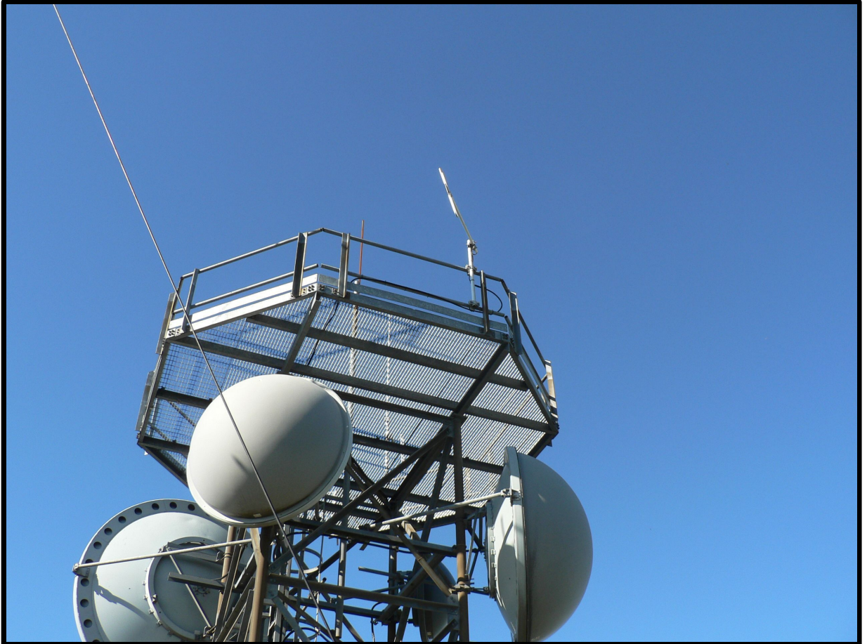
The site of the new '405 Taraponui antenna Installed 27 th November 2011.