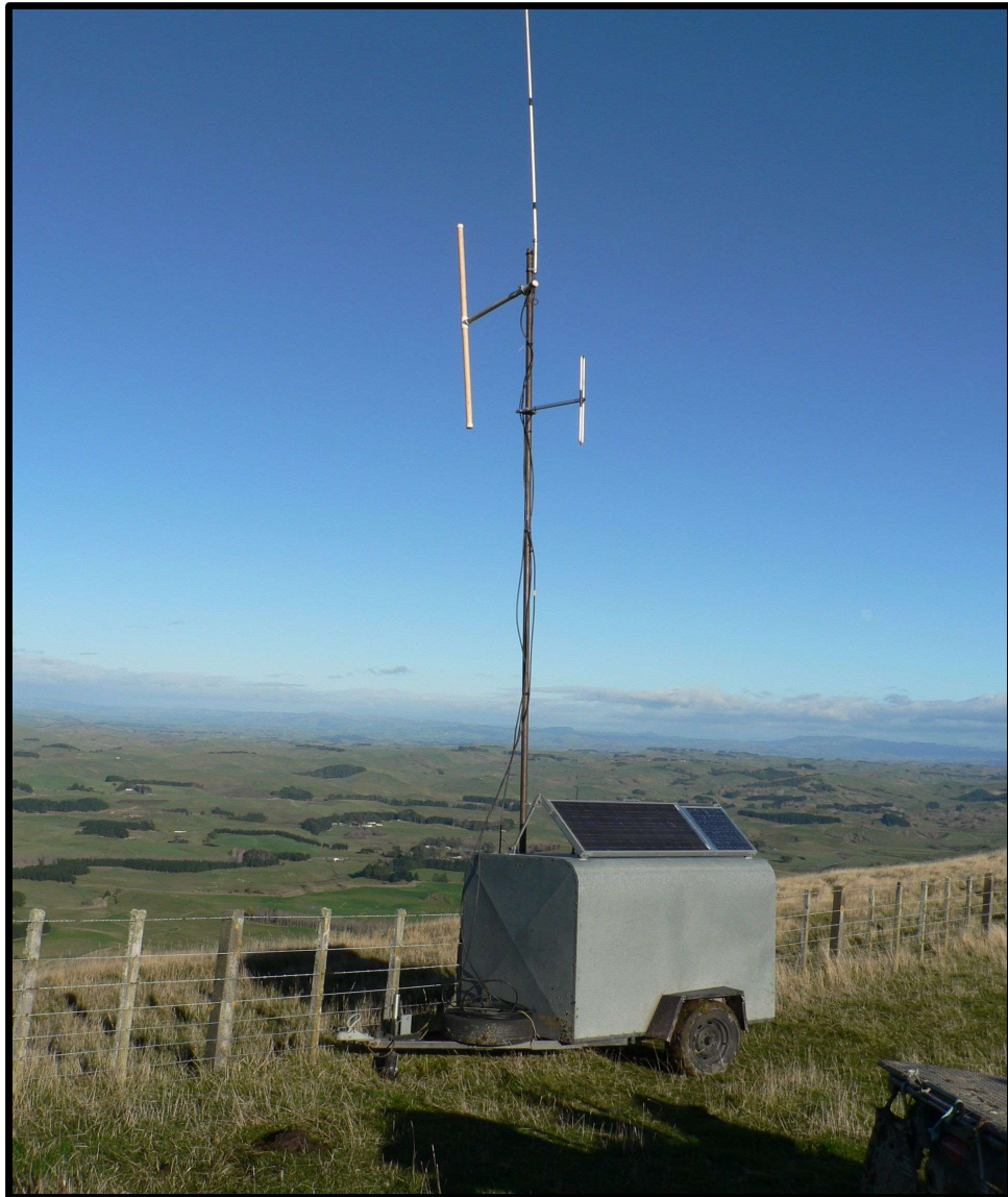
Repeater trailer set up at Omakere ready for the recent Hawkes Bay Rally