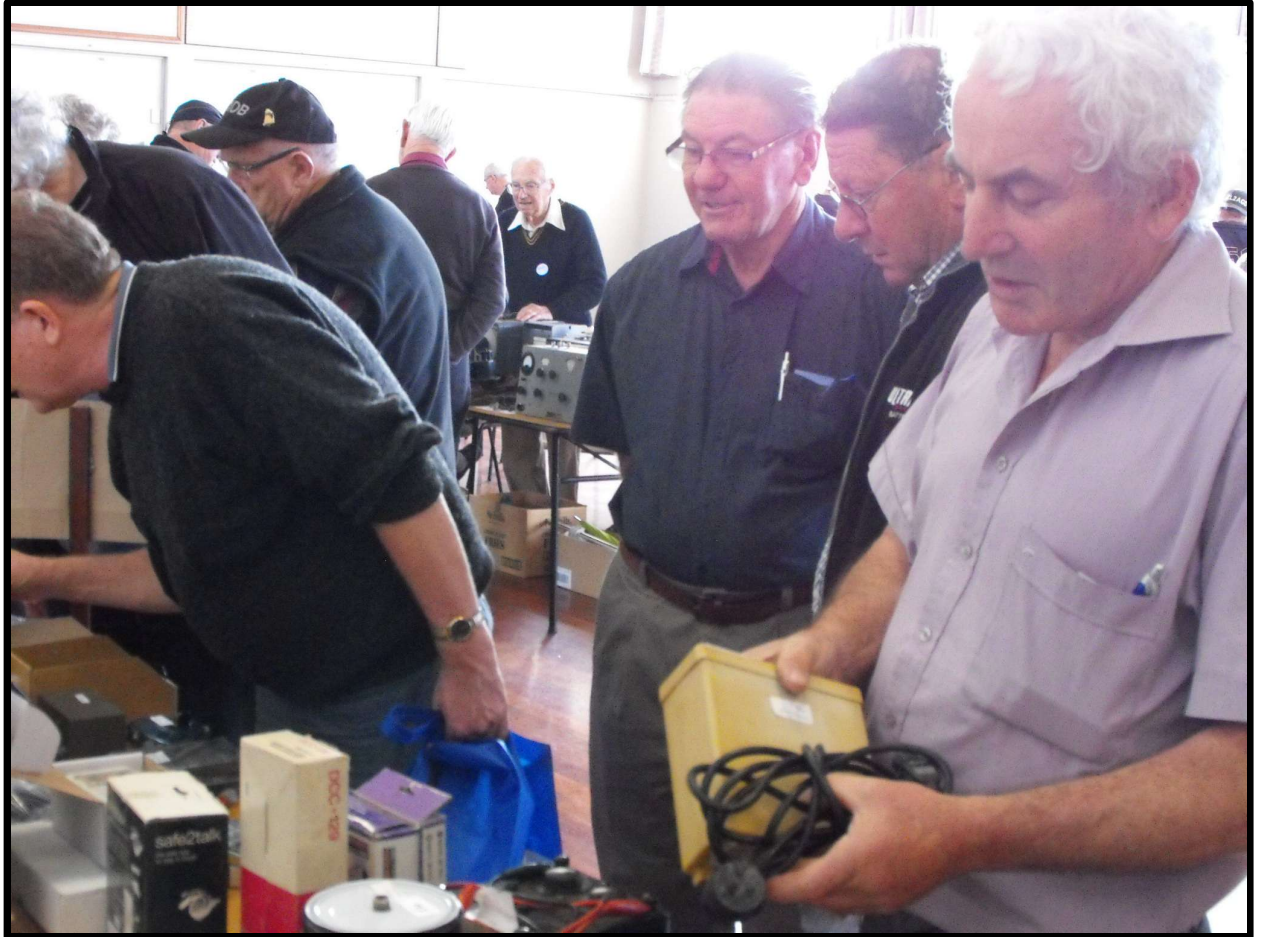
Our members hunting for bargains at the Paengaroa Junk Sale – More pics inside