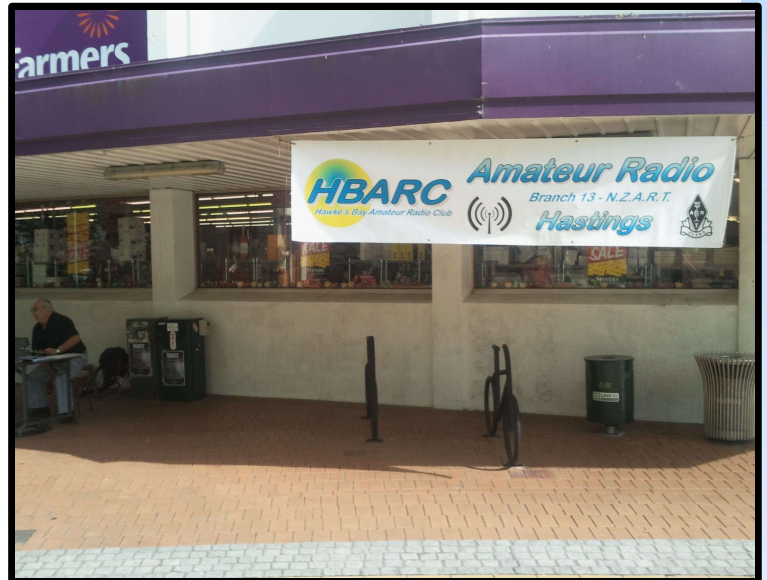
Close up of the signage