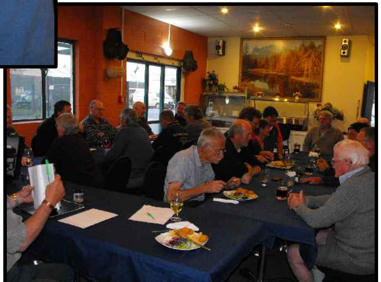
Meal time prior to the Meeting at Waipukurau