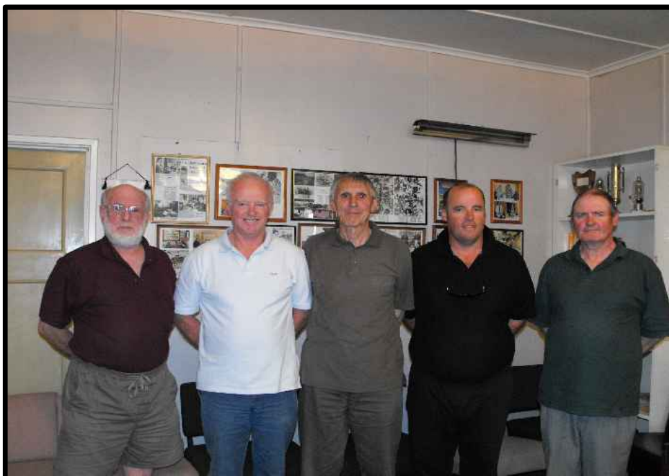
"The ZL2GT 80/160m Team"

Participants from the ZL2GT Team in the 80/160m July 2012 Competition (second over all).