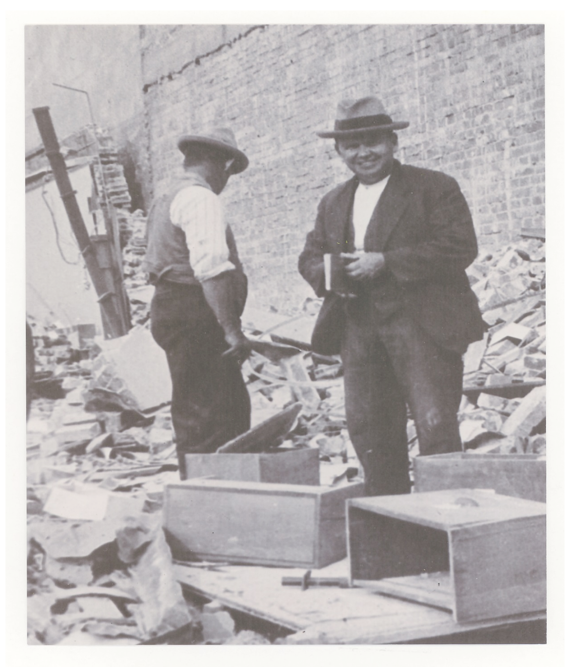
CLEANING UP AFTER THE 'QUAKE