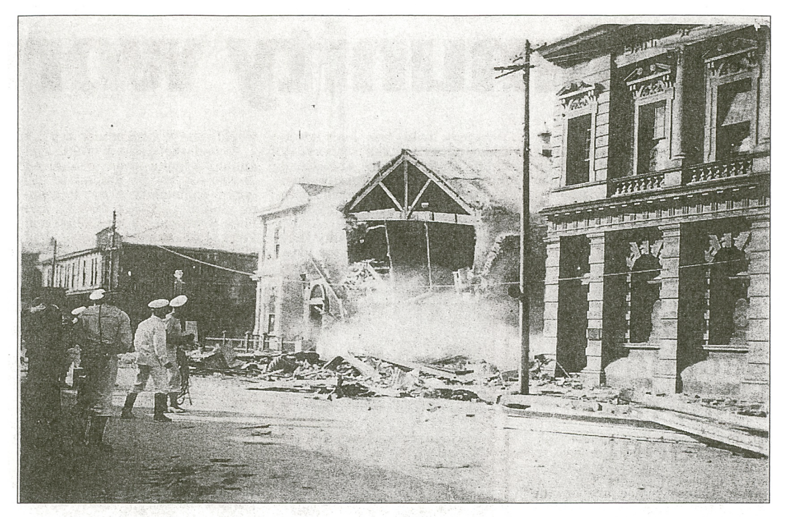
DEMOLITION DUTY: Sailors from HMS Diomede demolish Griffiths Boots in Heretaunga Street West (now BJ's Cafe )