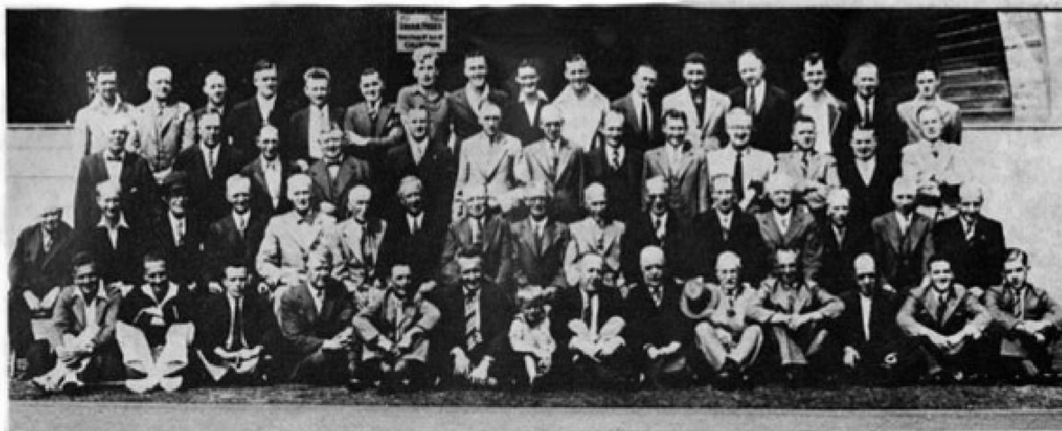
Napier Frivolity Minstrels, 40th Jubilee Anniversary