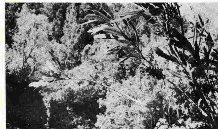
An extensive area of native flora, abounding with the rewarewa tree in full flower.

Also many different types of nectar, which change and fluctuate in quantity according to seasonal and yearly variations, are gathered resulting in production of comb honey that is diversified in flavour and colour.