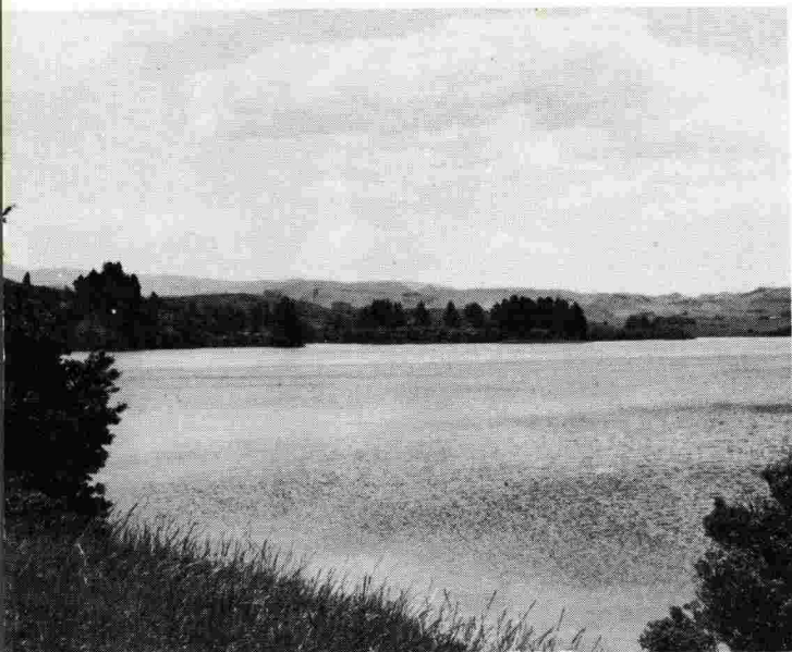
Lake Tutira, situated 40 miles from Havelock North, is one of the many locations for Arataki's honey gathering operations.

UNCONTAMINATED – New Zealand dark comb honey is gathered from the extensive areas of native flowers, shrubs, and trees – areas uninhabited, untouched and unpolluted by man.