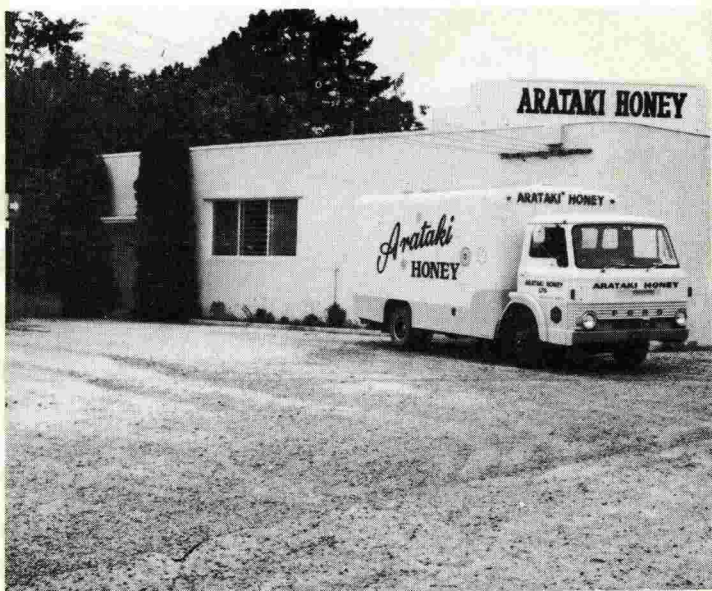
The Havelock North factory – a major centre of company operations.

HISTORY – the company was founded in 1944 by the present management, who prior to this date, had gained experience in this field through being involved in part-time beekeeping operations. From the outset the company has been characterised by a consistently high rate of growth. Substantial capital growth has been achieved through the expansion of the company from the Havelock North area to include the Waio tapu region and by increasing the number of hives from 8,000 to 14,000. Technological growth has increased production and saved labour through the application of improved beekeeping methods and new machinery, much of which has been developed by members of the company.