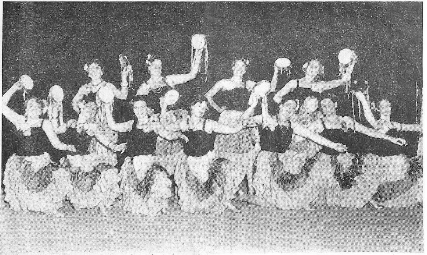
SPANISH LADIES OF THE CHORUS.