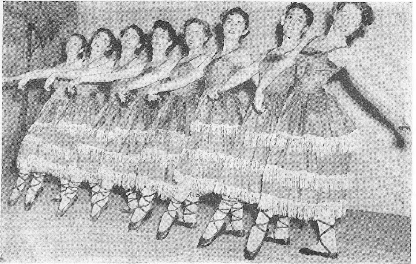
THE SPANISH BALLET.