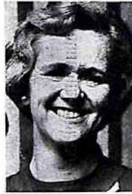
Fay Rogers (Wardrobe)