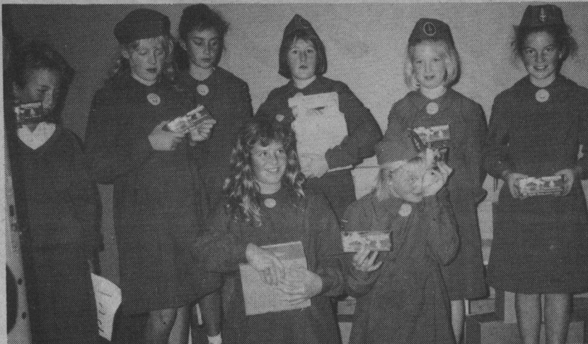
The 2nd Hastings company Girls' Brigade received their quota of chocolate almonds ready to sell during national Girls' Brigade week.

The story of the Girls' Brigade begins with an experience on a chilly Saturday afternoon in the year 1893.