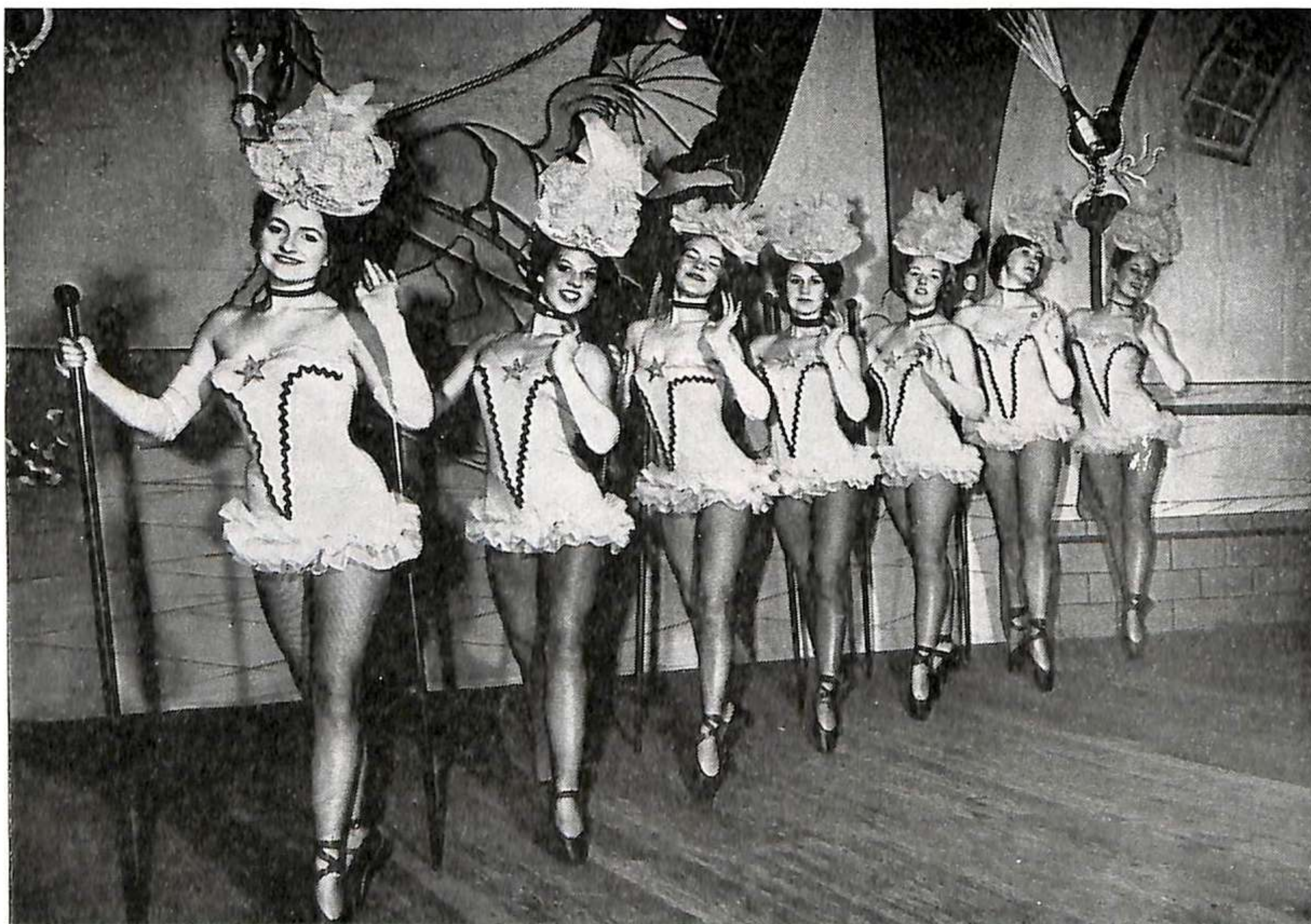
THE GARTER GIRL BALLET