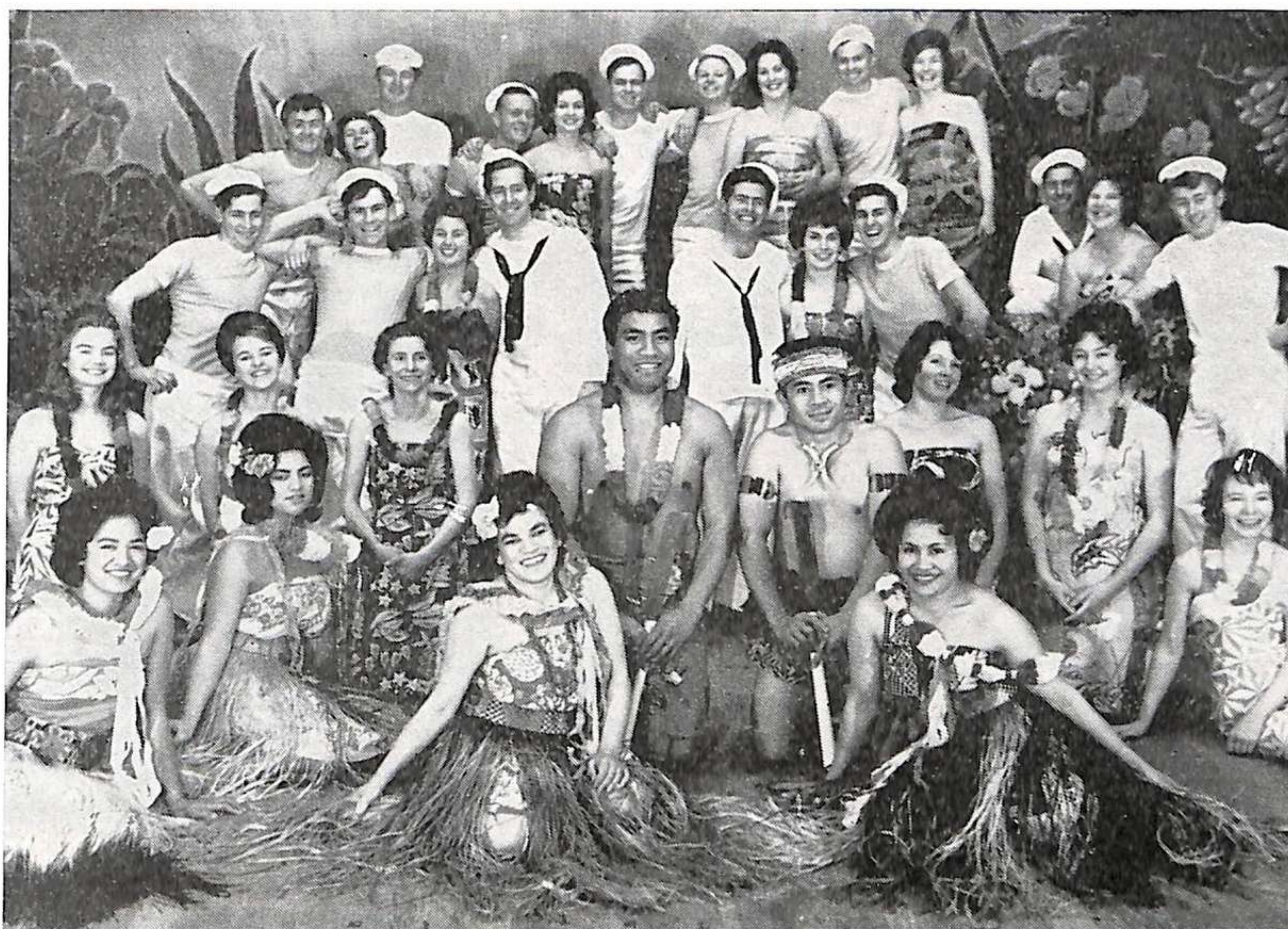
RAROTONGA SCENE — CHORUS