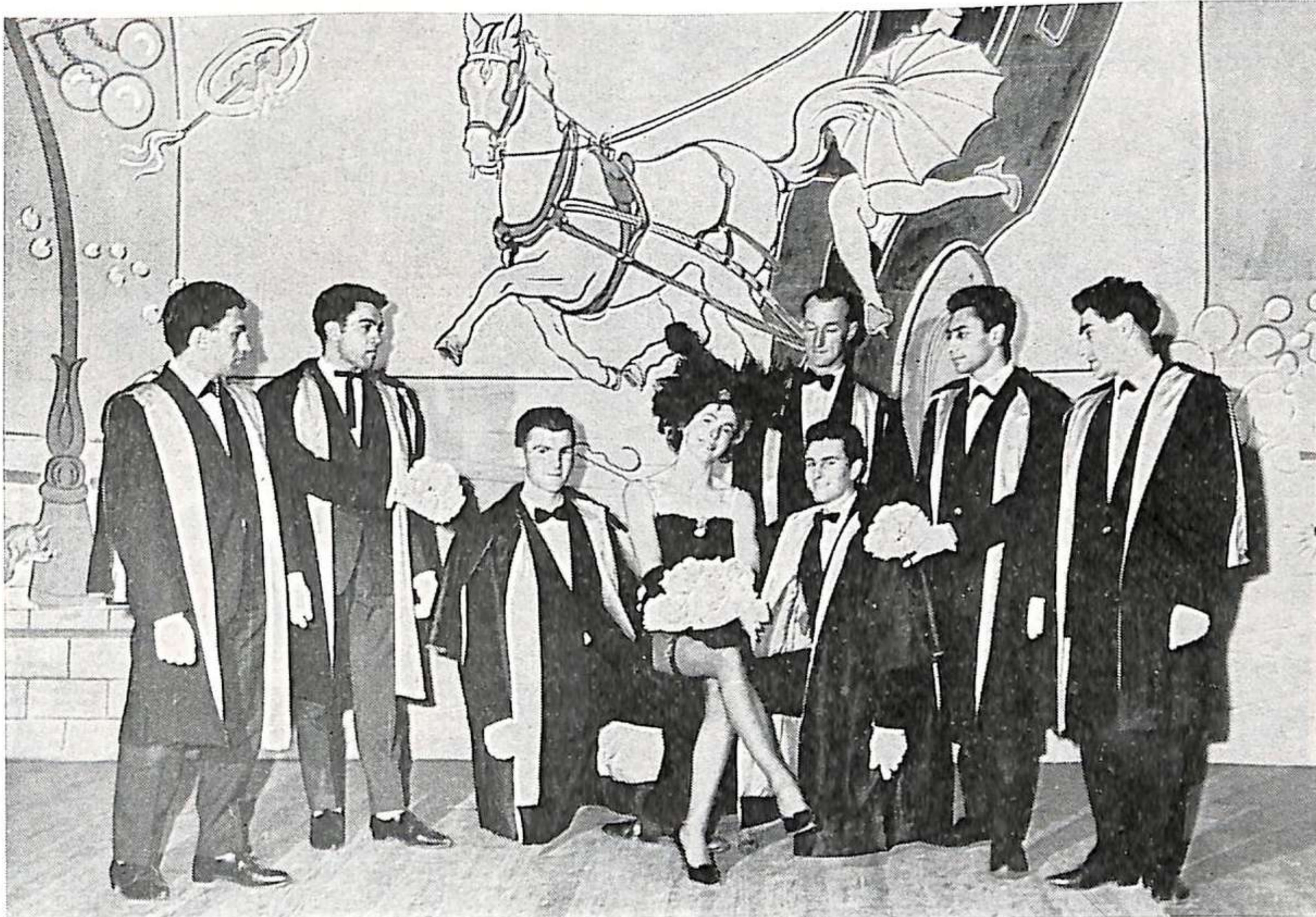
THE GARTER GIRL BALLET