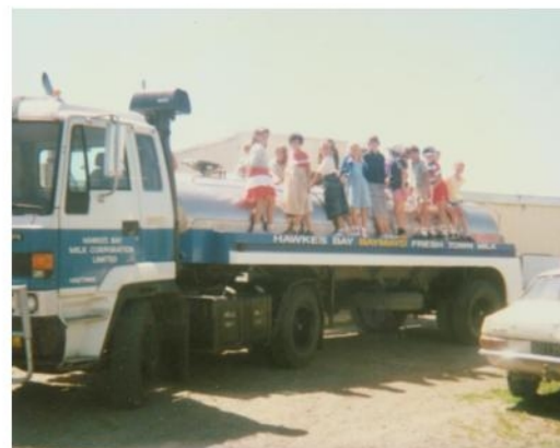
Middle room trip to dairy farm on Swamp Rd, 10/11/88