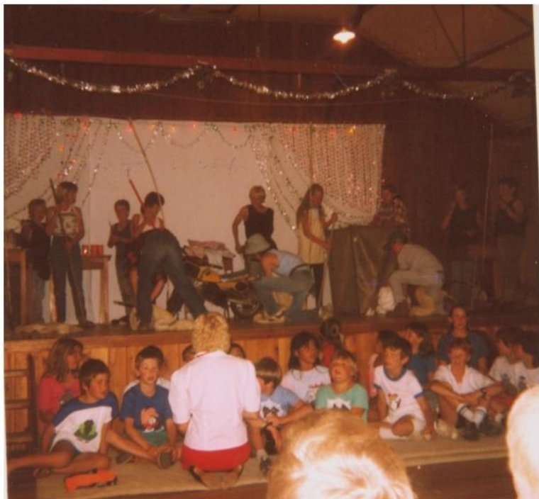
"Click Go the Shears"