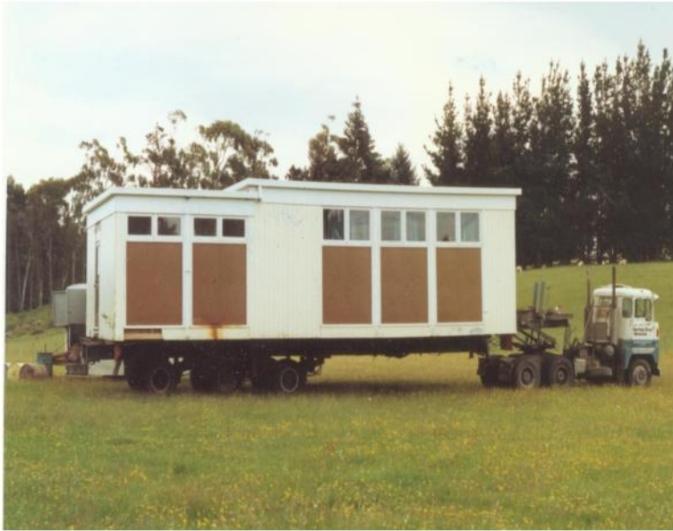
New classroom, 18 January 1988 (from Otamauri School)