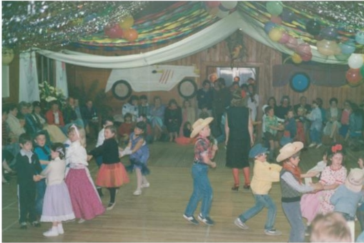
Dancing Through the Ages Sherenden Hall, 25 August 1988