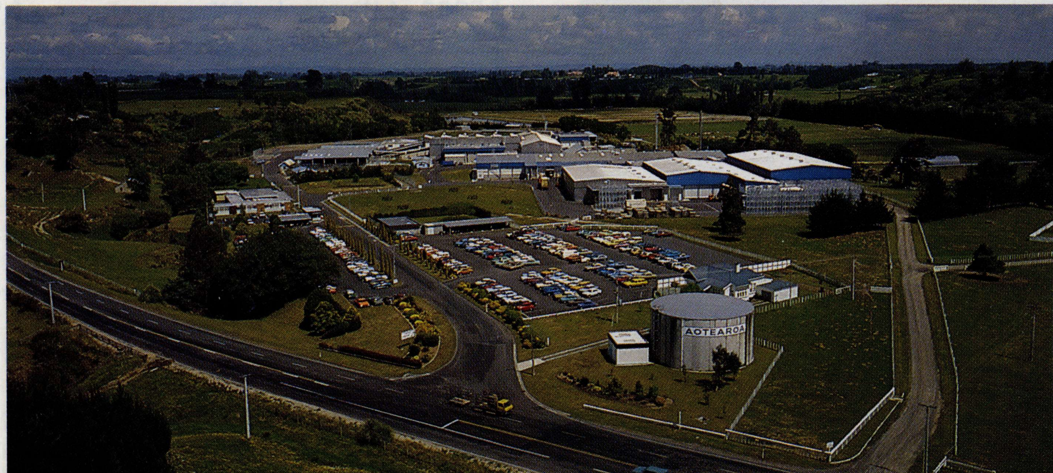
Crown's Aotearoa Meats at Cambridge

He also says that the wider interests of the new company — which include fruit canning, pig farming, animal by-product manufacture and pet food production — will provide opportunities for promotion not previously possible.