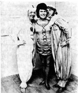
"BONZO" AND "BOKKO" BEFRIEND "MITZI".