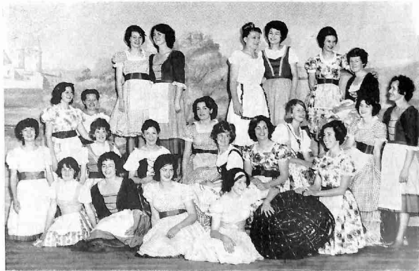
THE LADIES OF THE CHORUS