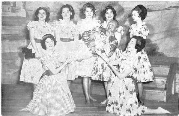
CRUMPET WITH THE CHORUS DANCERS

Day Phone 7868 Napier — Say It With Flowers