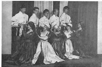
"Kiss Me Kate" Dancers