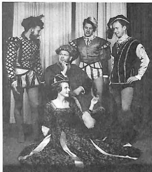
Baptisa, Bianca and Suitors