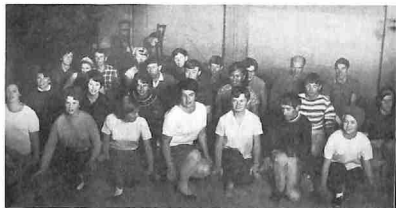
The Chorus "Another Op'nin' Another Show"