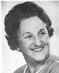
Producer: SADIE BROWN

"Each show is an individual challenge and I trust that I have done justice to the script and to you, the audience, for these have been my personal goals in this production."