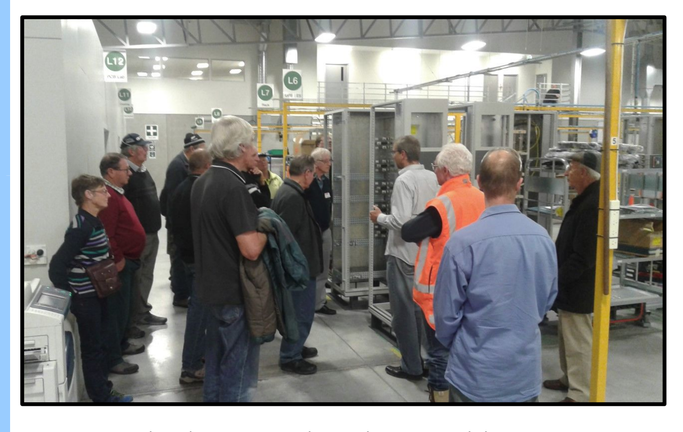
Our Branch 13/HBARC group being shown around the ABB operation, a great night