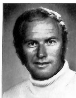
Publicity Officer —