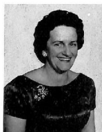
Wardrobe Mistress —