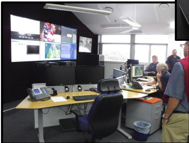
Presentation hall and operating positions at RCC, with Club members looking on