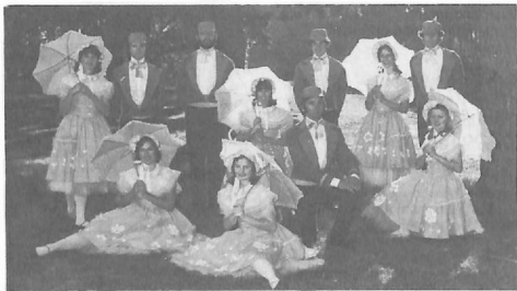
Members of the Young Persons Dancing Society