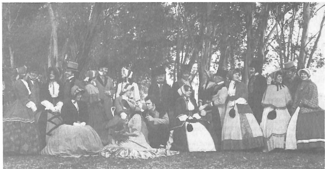
In the Vienna Woods — Ladies and Gentlemen of the Chorus