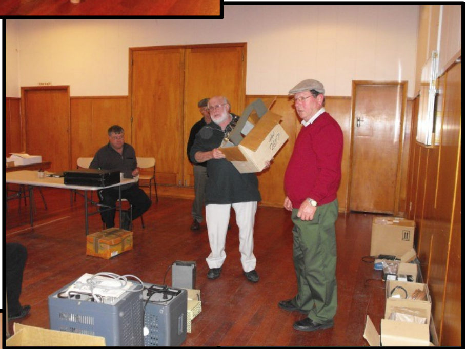
Auctioneers and helpers