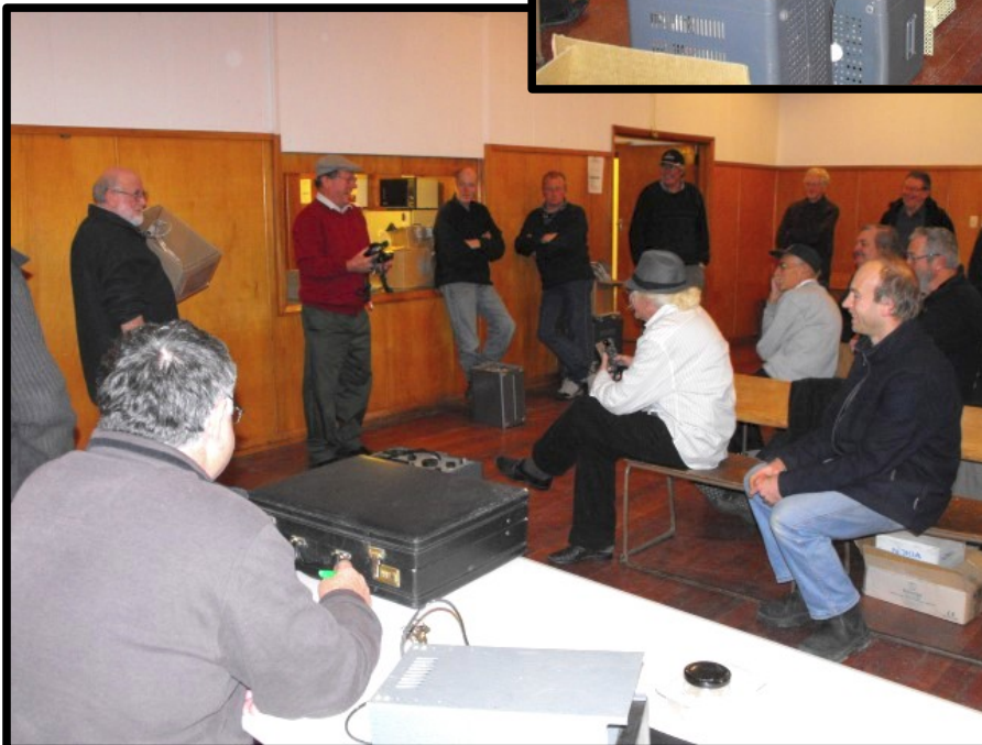
Auctioneers and bidders