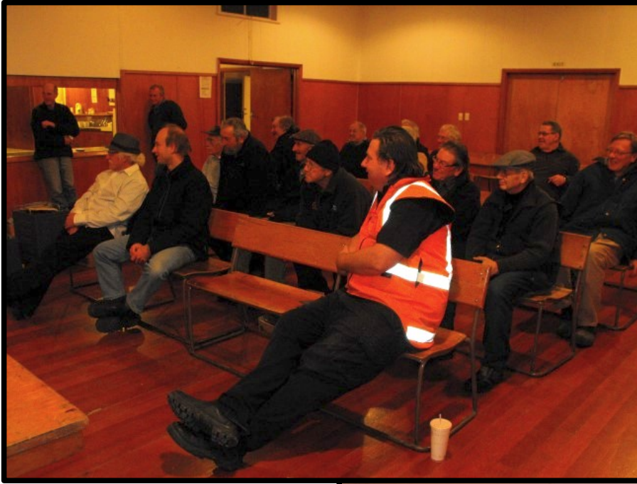
Some of the bidders