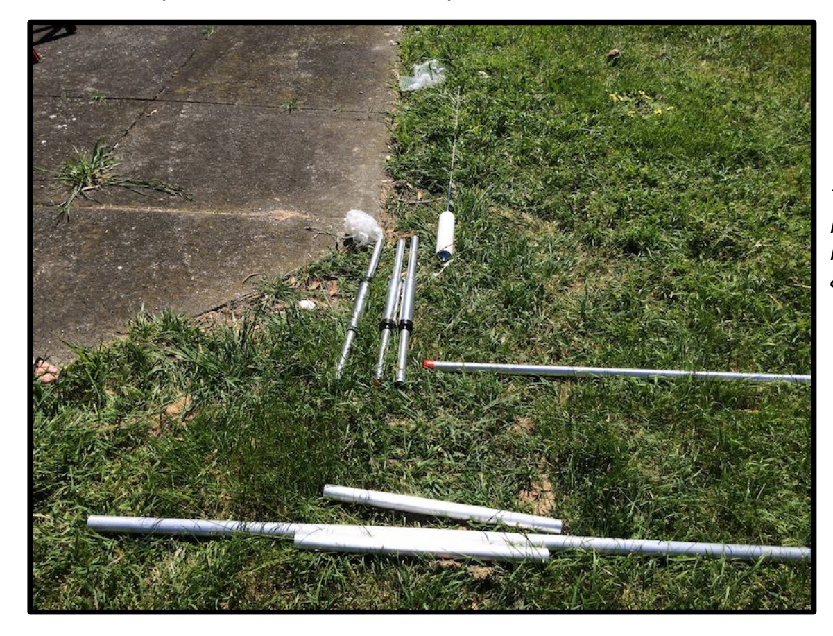
The Hustler laid out and ready to assemble

The second job was to assemble the Hustler vertical antenna and get it on the mast. The photos below tell the story.