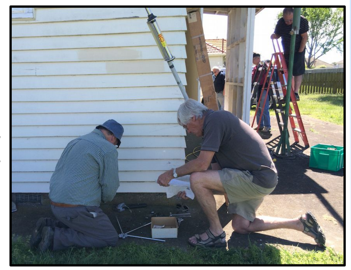
Maybe we should read the instruction manual?