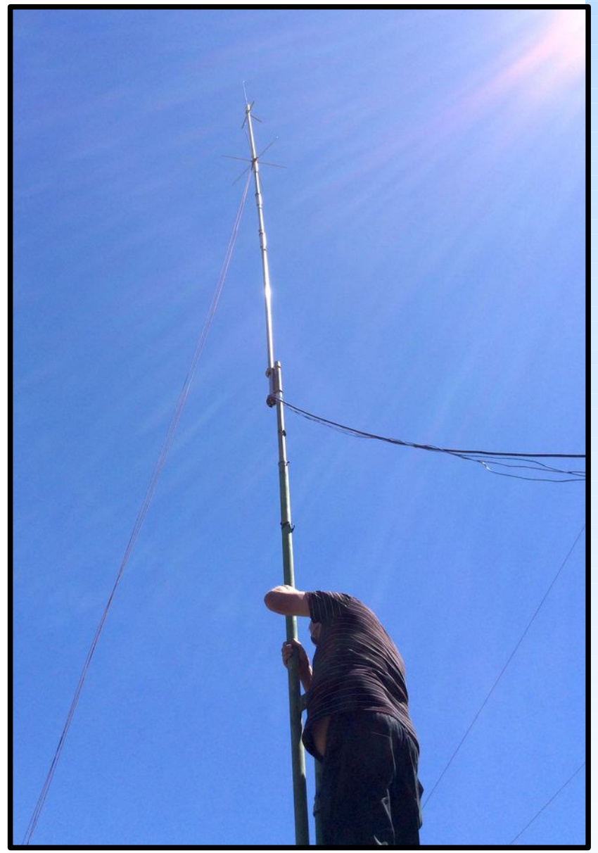
The Hustler raised to it's operating position.