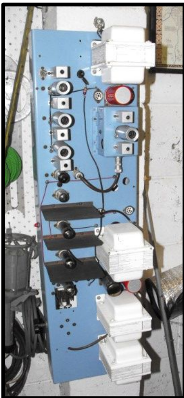
original TV translator chassis as used at Kahuranaki from April 1963