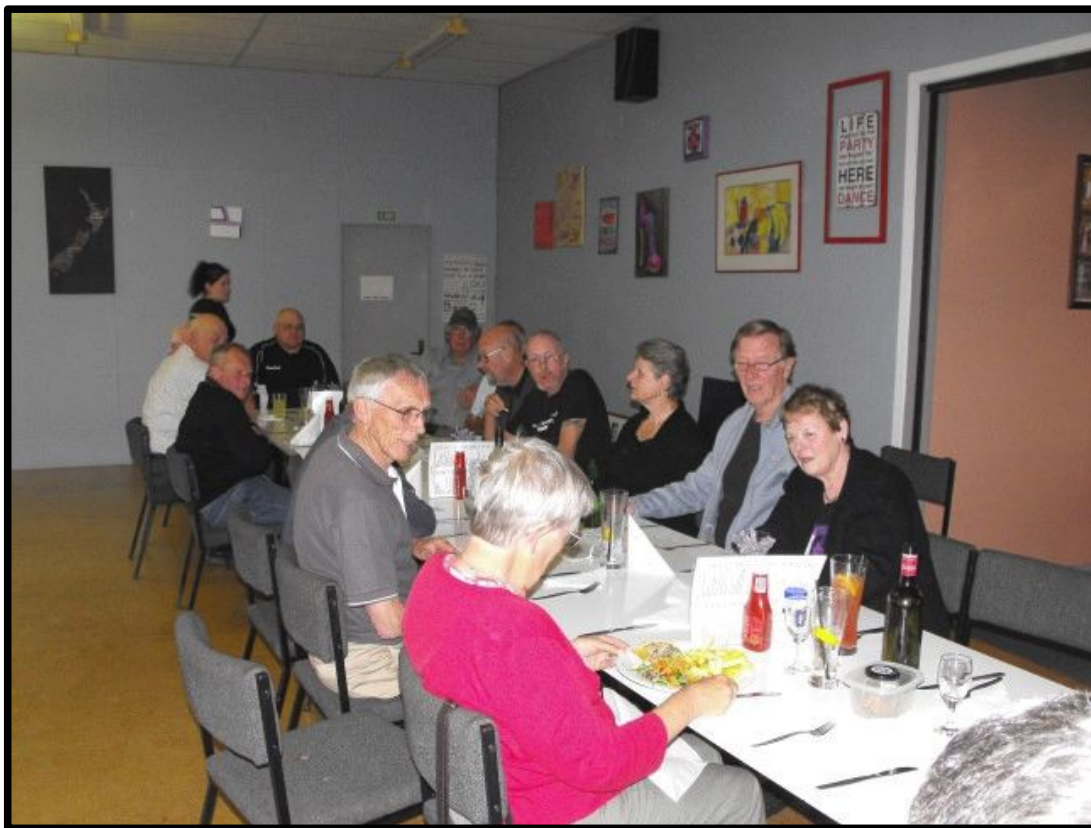
Some of those gathered at Waipawa CHB for the Branch 13 "CHB Meal and Meeting", held in October