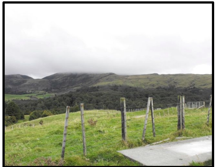
Cloud cap on Taraponui