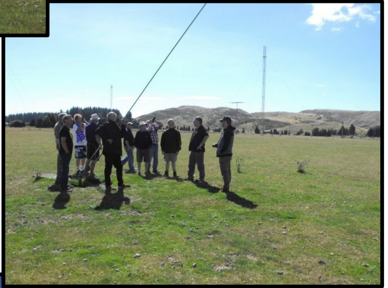
Some of the group gathered near the rhombic towers and an HF LPY in the background