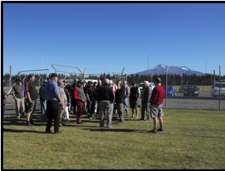
The group gathered at Irirangi Tx station, with Mt Ruapehu in the background