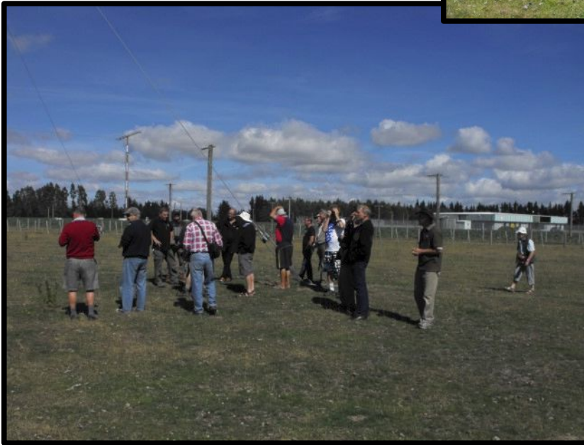
HF LPY, o/w feeder poles and the transmitter building