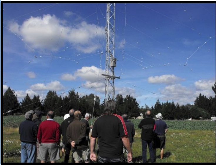
The group gathered at the base the TCI Log Periodic ant. (it sends the tx sig. straight up) (the box shown is the balun).