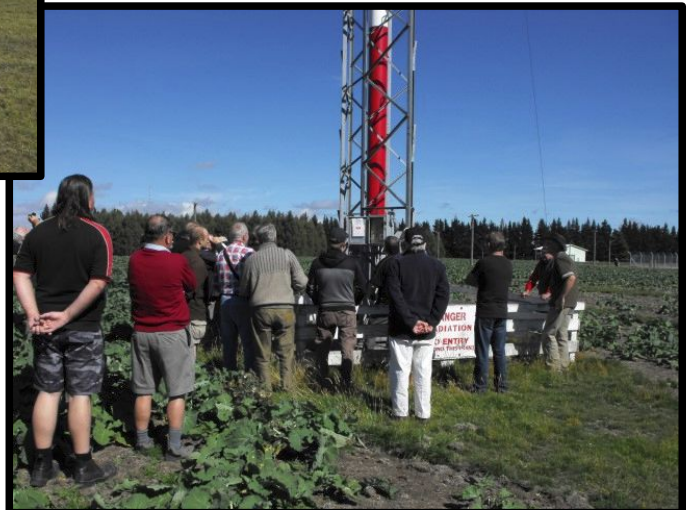
The group gathered at the base of one of the HF LPY aerials