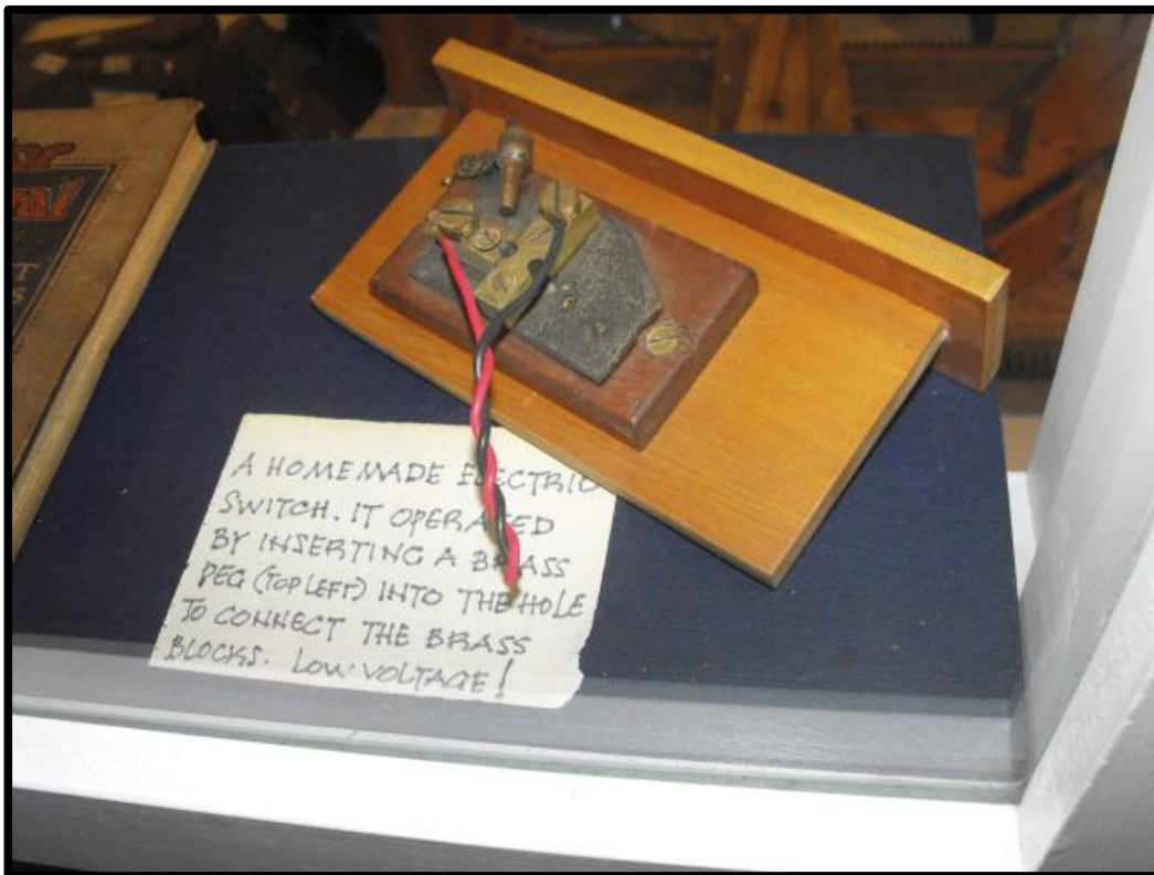
A home made electric switch noticed in the Collingwood (top of the South Island) Museum