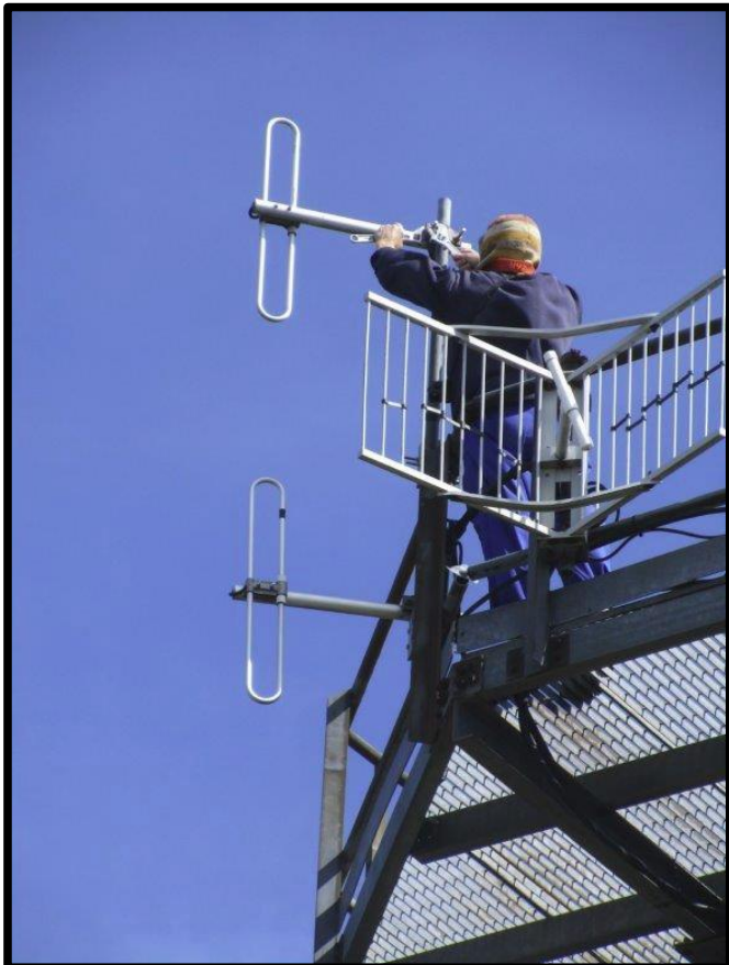
David ZL2DW realigning one of the two '725 Tx aerials at Taraponui. Wind and Ice had blown one dipole off alignment skewing the radiation pattern