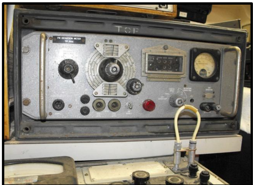
A selection of pictures of old test gear and R/T's, taken during our holidays, ZL2DW