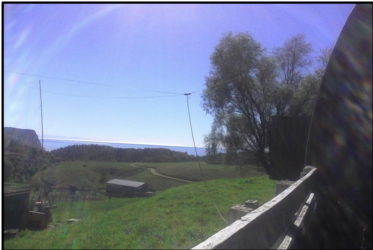
Napier Branch 25 Jock White Field Day location