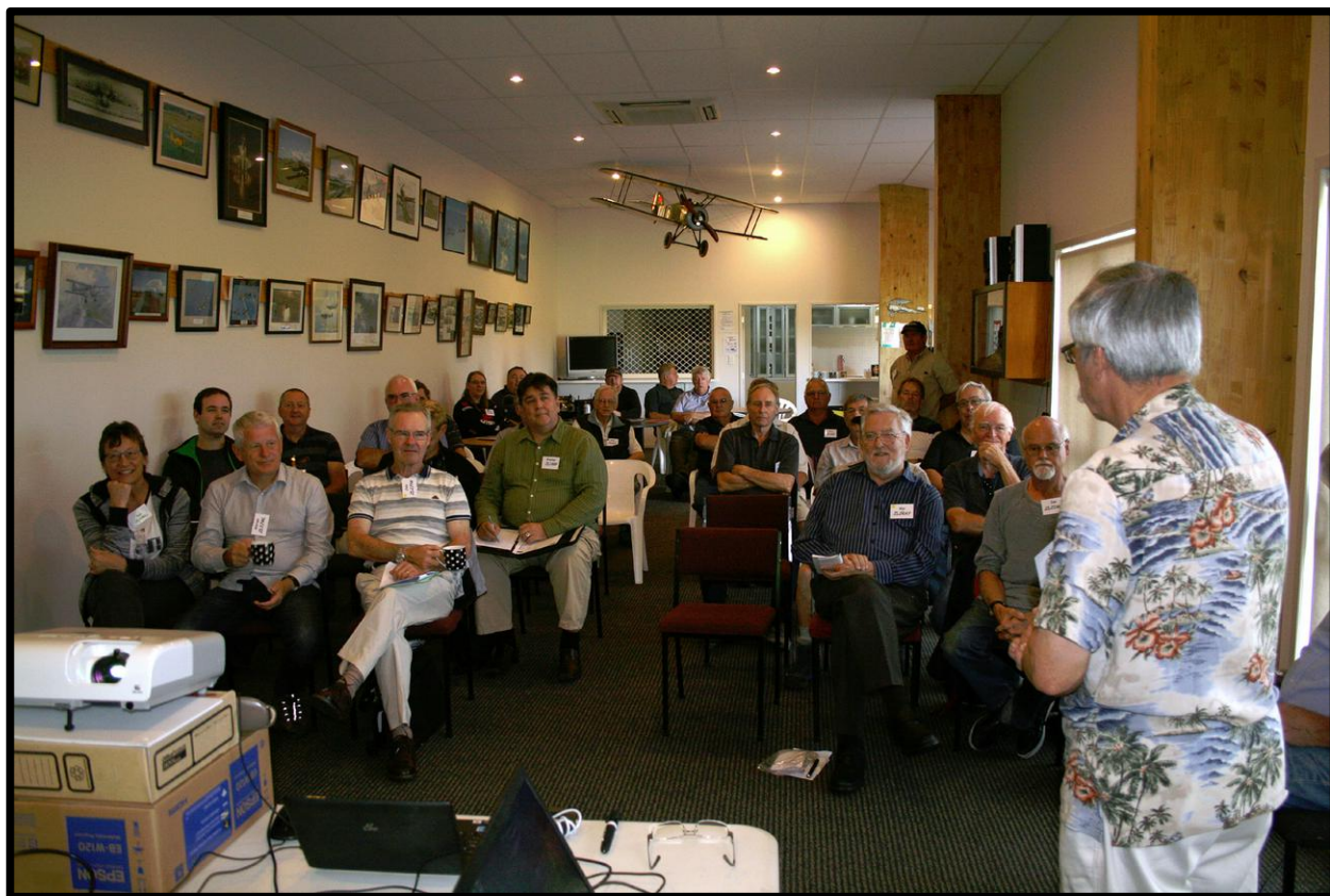
Branch 25's Hamfest in full flight – more inside