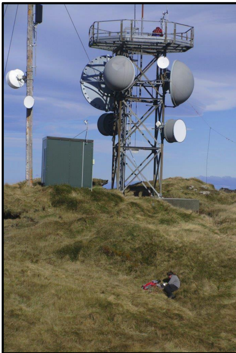
Taraponui Beckons - article inside