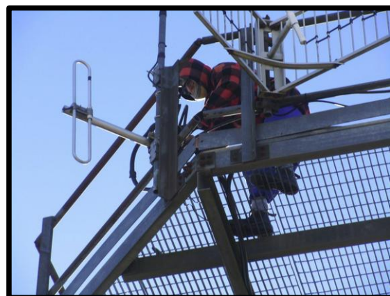
David ZL2DW wrapped up against the elements dealing with the '725 Tx aerial