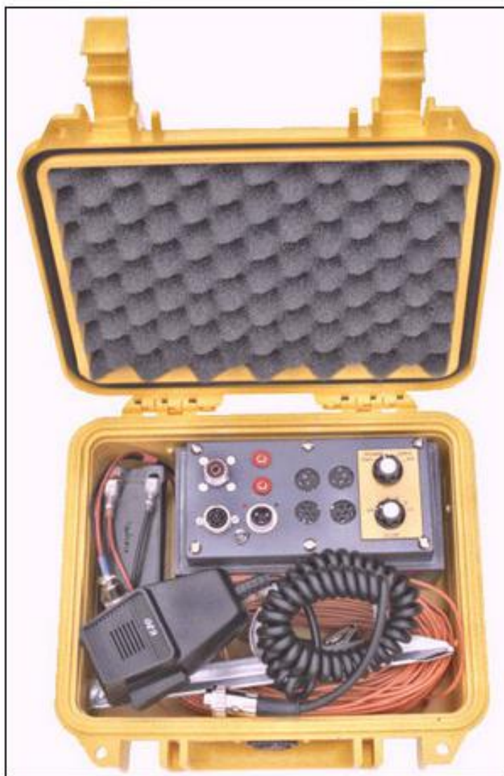
LF Transmitter used in Thai cave rescue designed by Ham Story inside