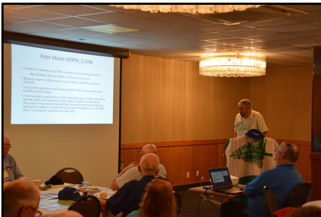
Here is the DX Luncheon

Over 40 Seminars on a wide range of subjects were available on Saturday and Sunday.