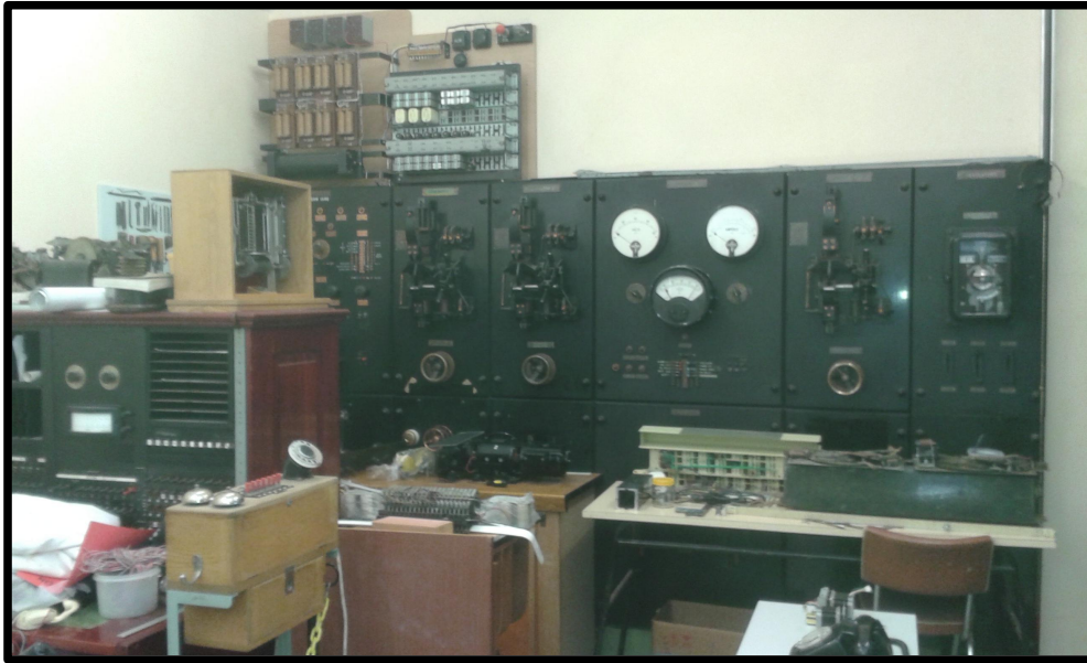
Tait's "Upstairs Museum" Sample of many products made by Tait.