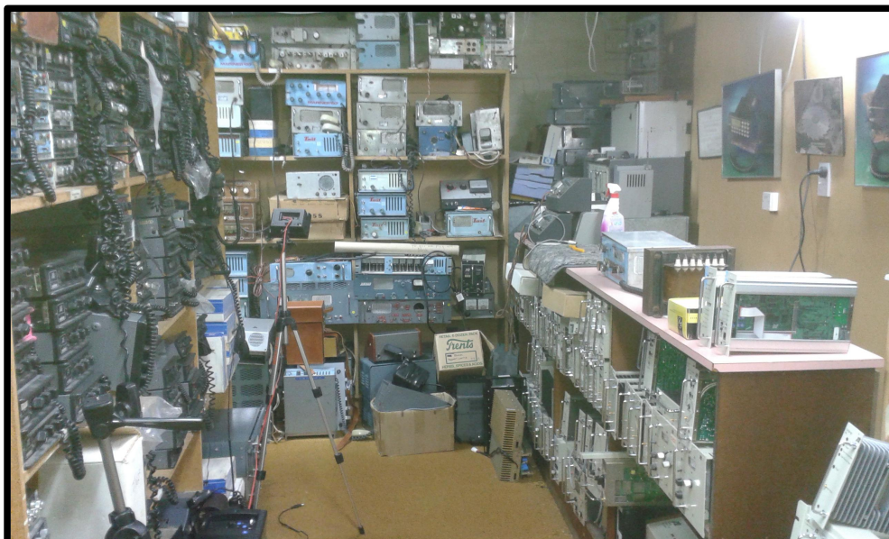
P & T equipment in back room at Ferrymead