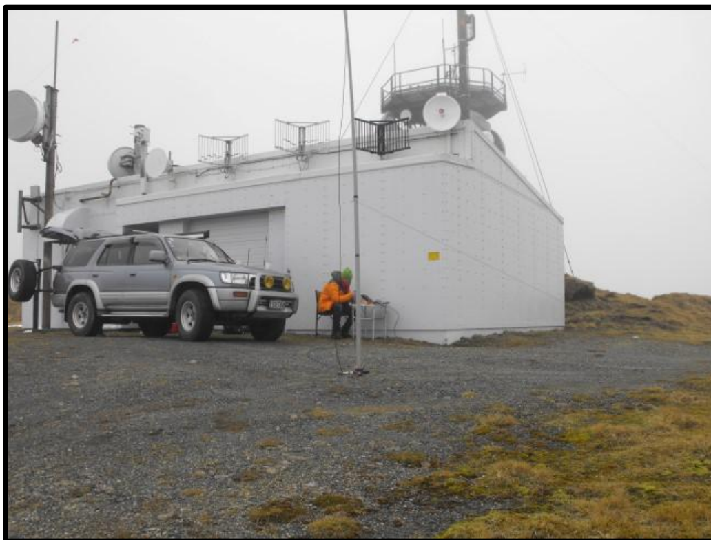
Warren ZL2JML working SOTA at Taraponui HB