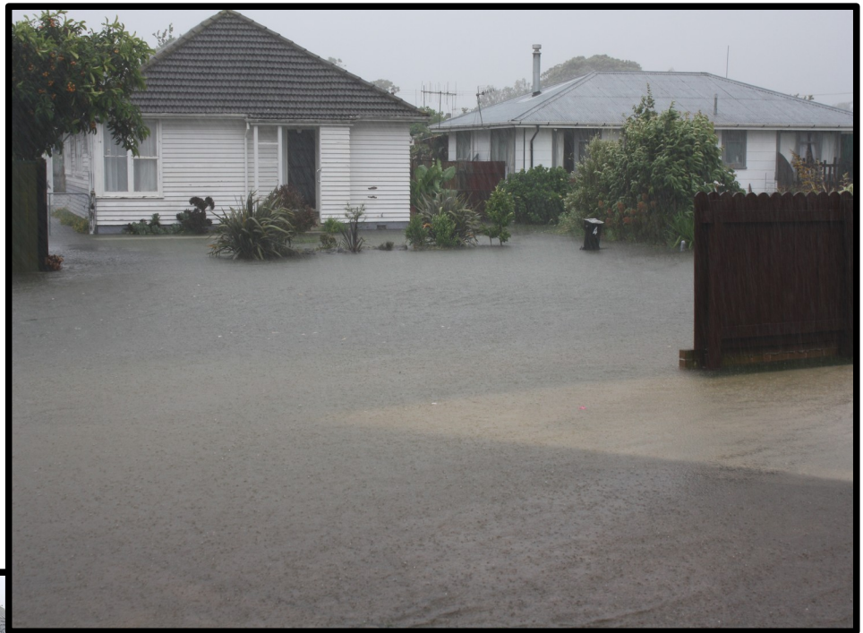
Blue ZL3TT's house during the Napier floods – a one in 250 year event