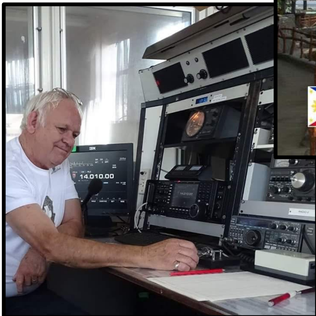
Operating from ZLZLD