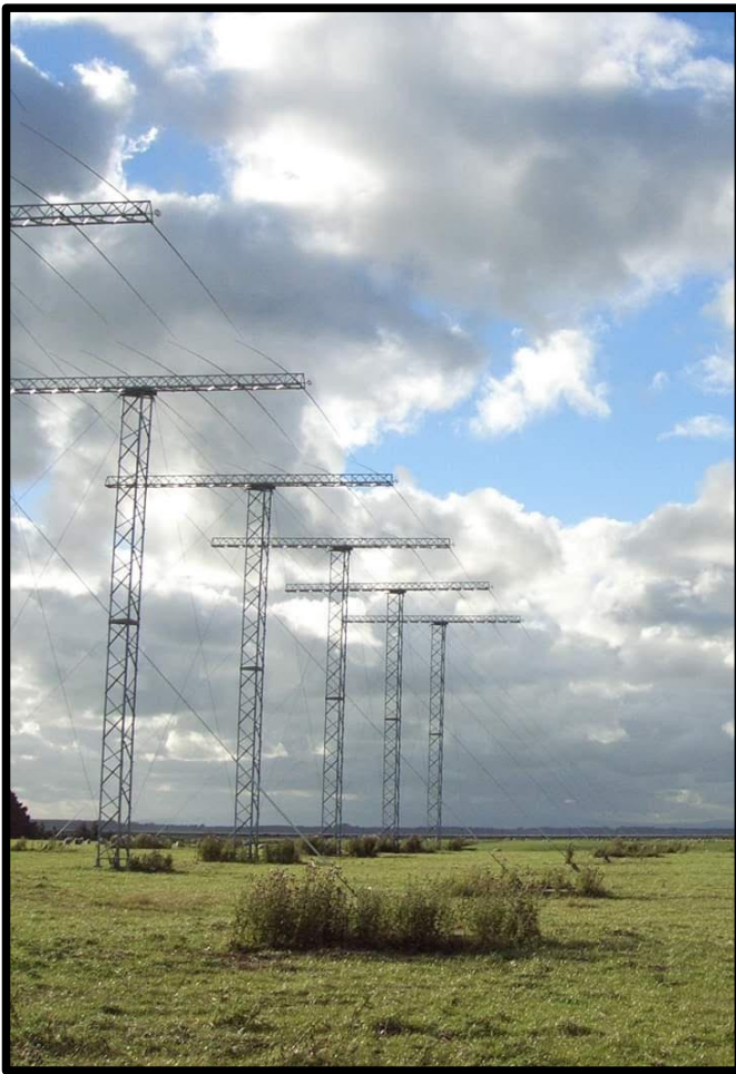
Sabre LPY's, Awarua Radio ZLB