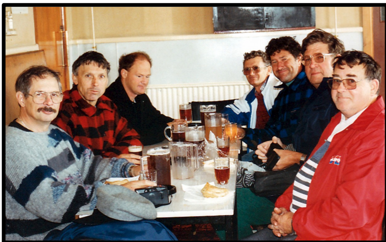
Celebration before returning home, Waitangi Hotel, Chatham Islands, 1993.