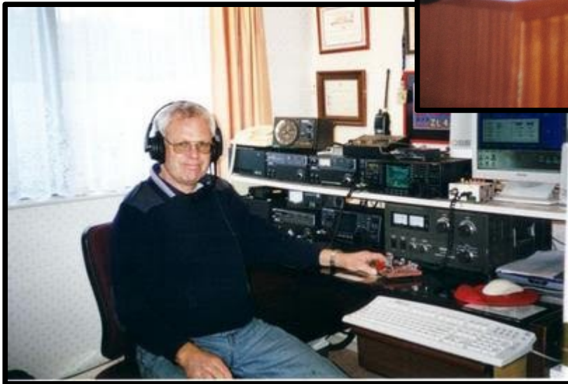
Home Stn ZL4PO Nelson 1990's