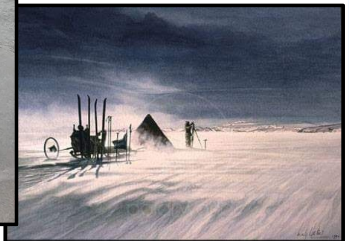
Antarctica (ZL5AP), 1972-73