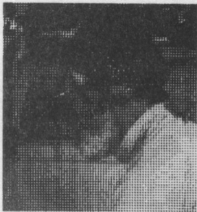
Valentine Road, RD5, Hastings.