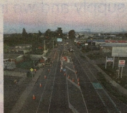
Council approved service installer!!