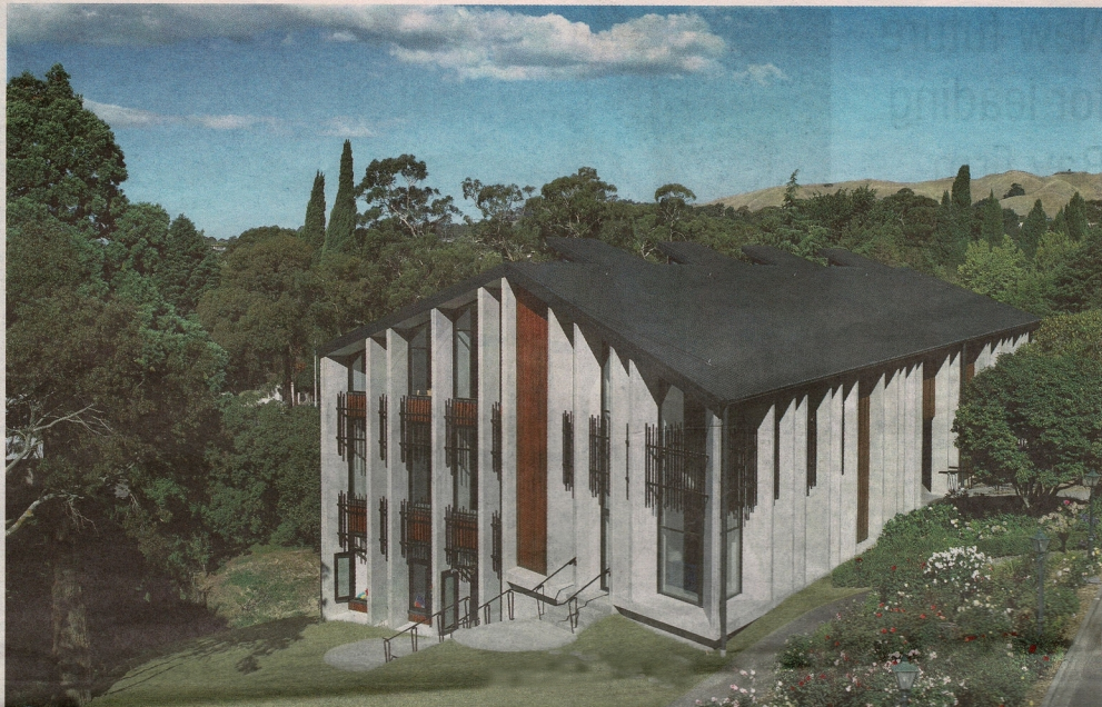
MCL has built many stunning buildings in the Hawke's Bay region including the Iona College Information Resource Centre.