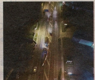
Civil Drainage Specialists