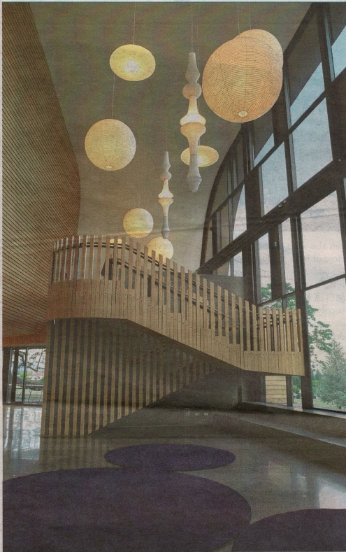
MCL Construction carries out all types of work from housing to major commercial buildings.