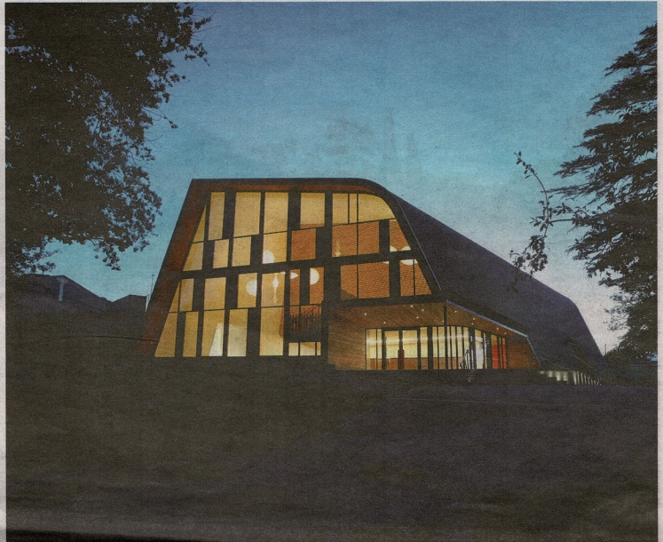
The New Zealand Gold Architecture Award winning Iona College Performing arts Centre - another standout building by MCL Construction.