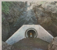
325mm Concrete Pipe Existing Wing Wall

Email: Mark@drainways.co.nz PO BOX 2360 Stortford Lodge, Hastings