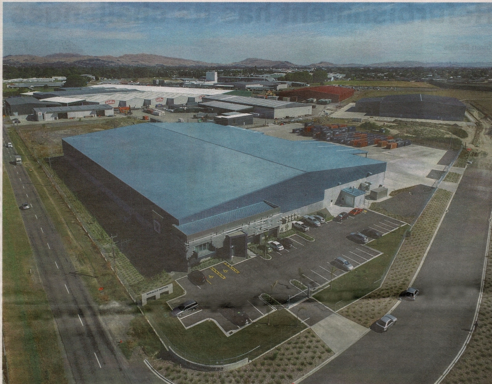
Projects recently completed by MCL Construction include a 9000sqm water bottling facility, including office and factory, for Tomoana Water.