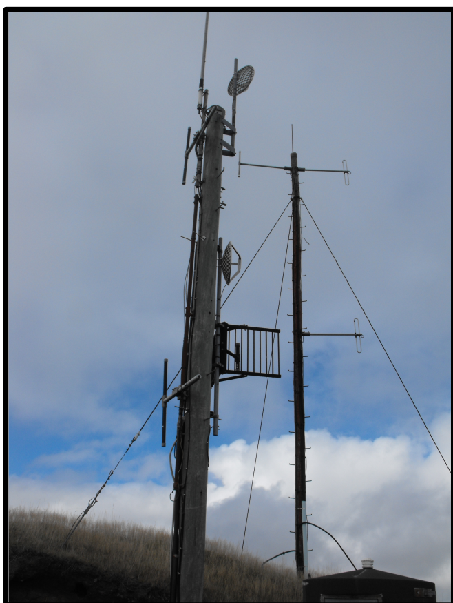
Aerials for 690 and the NS (The RH pole is for a site commercial user)

'690 and the National System at Whakapunaki (for Gisborne/Wairoa etc coverage)