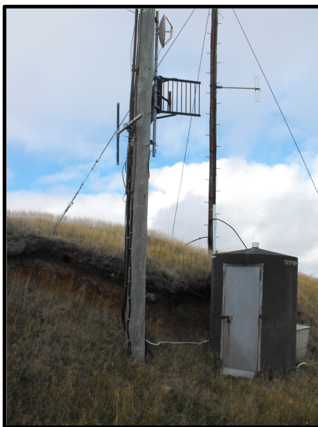
Equipment building and lower mast