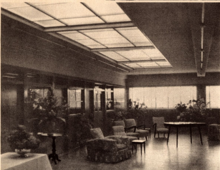
Section of new office accommodation prepared for reception of H.M. the Queen and H.R.H. the Duke of Edinburgh.