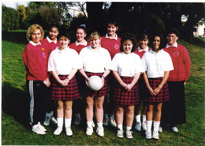
HAUMOANA NETBALL CLUB SENIOR TEAM