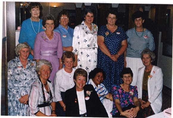
Players from the 1950's at the 1990 re-union.