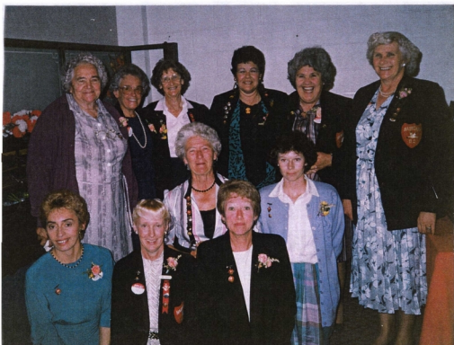
Life members at the 1990 re-union.