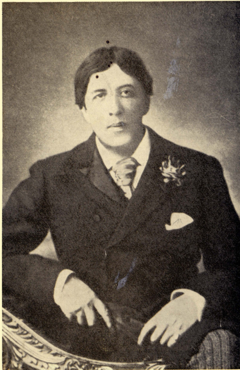
OSCAR WILDE 1854-1900