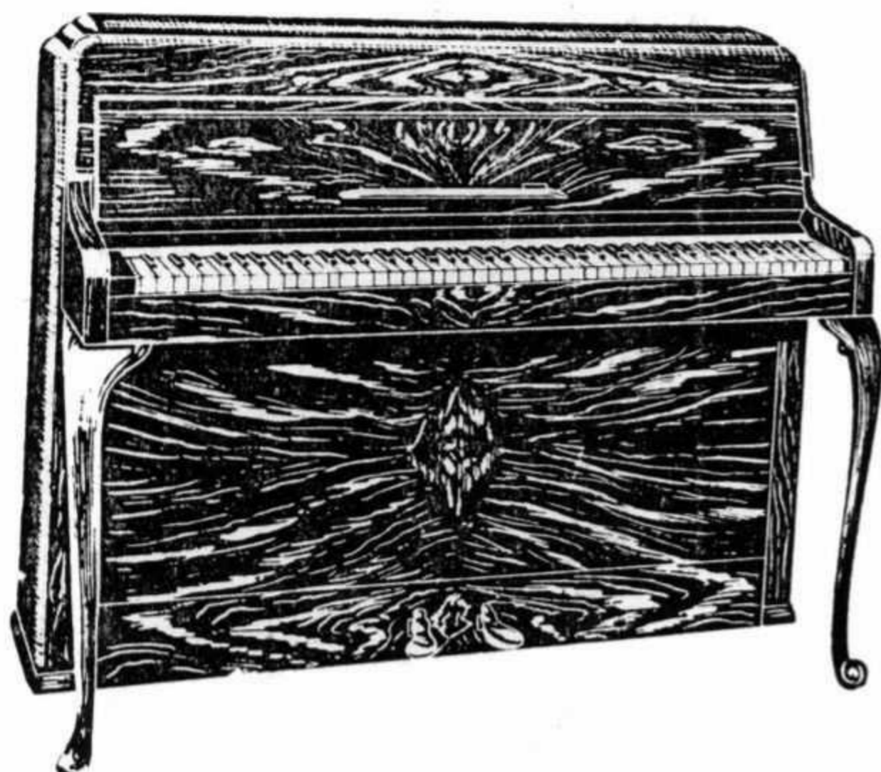
THE KNIGHT PIANOFORTE

See the Lovely Models in Walnut or Mahogany