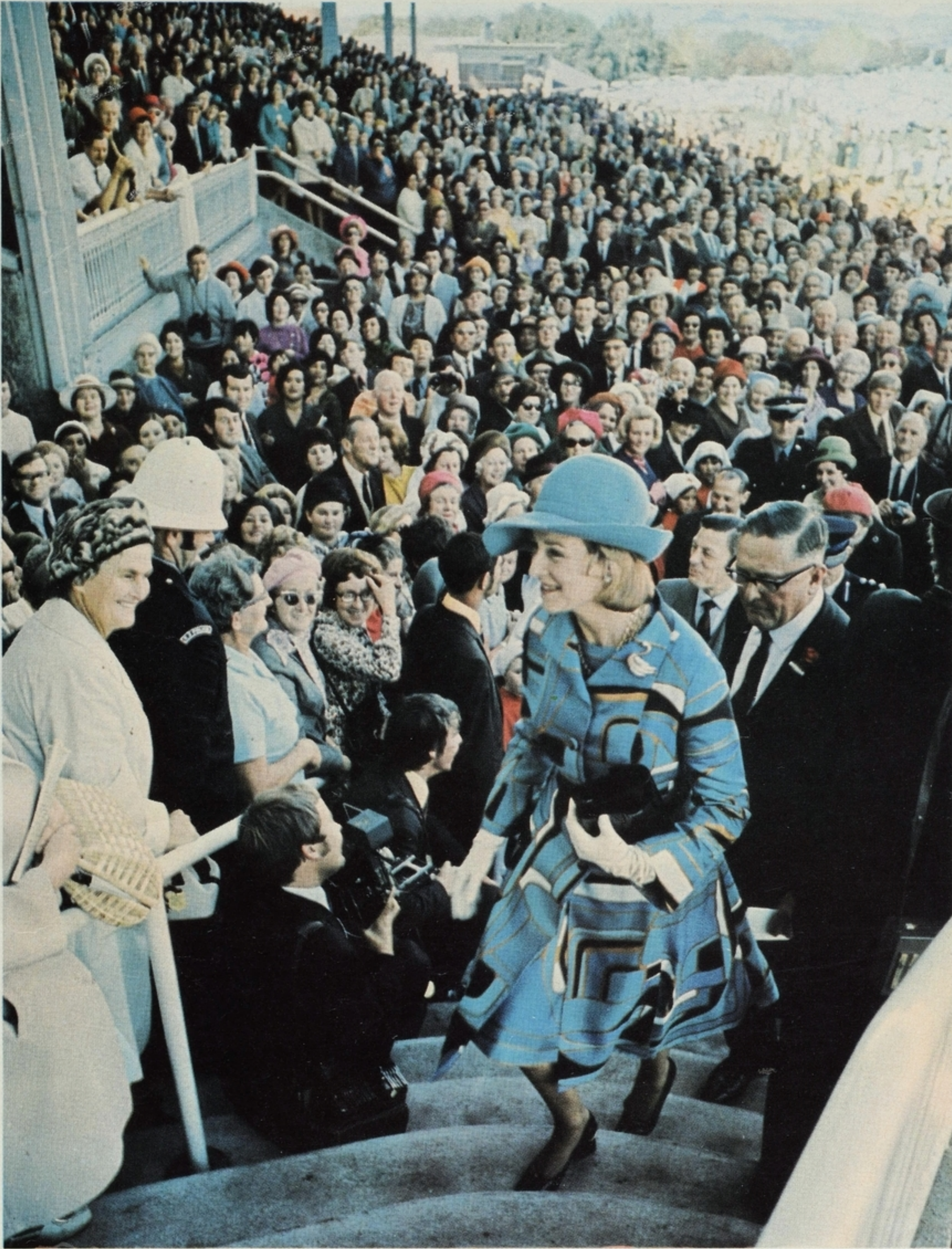
Princess Alexandra, all in blue, ascending the stairs of a packed grandstand at the Hastings racecourse where the Royal visitors saw the running of the Princess Alexandra Gold Cup.