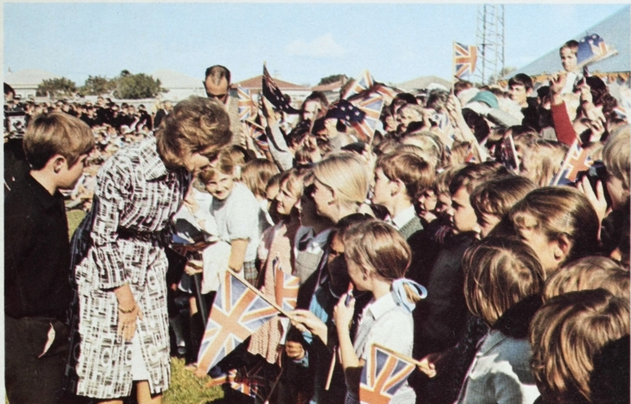
The Princess found hundreds of young friends and admirers in the large groups of Hawkes Bay school children assembled in McLean Park, Napier. Her Royal Highness is seen with children from Henry Hill primary school, many of them patriotically waving flags.