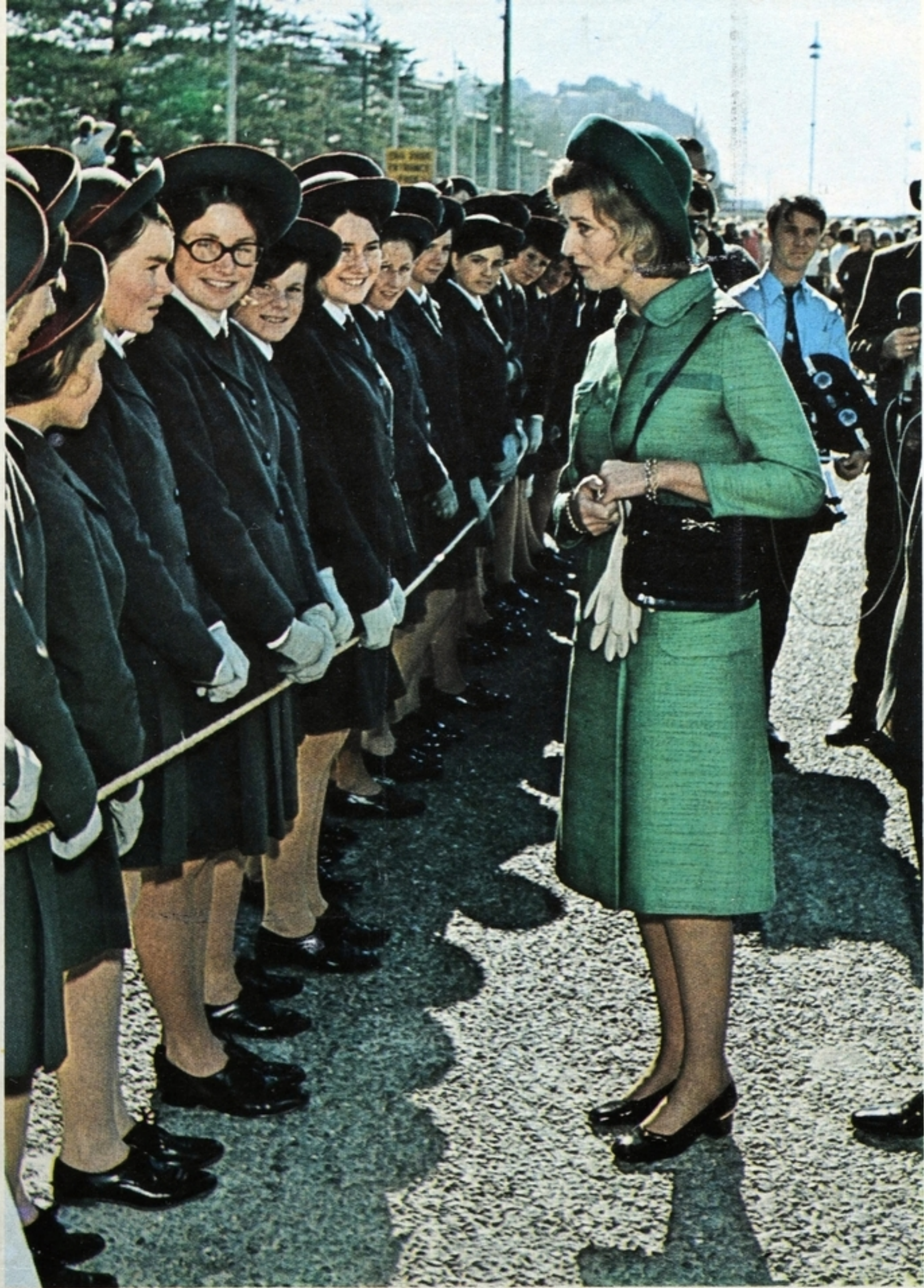
Above: Princess Alexandra meeting school children during her walk along the Marine Parade soon after arriving in Napier.