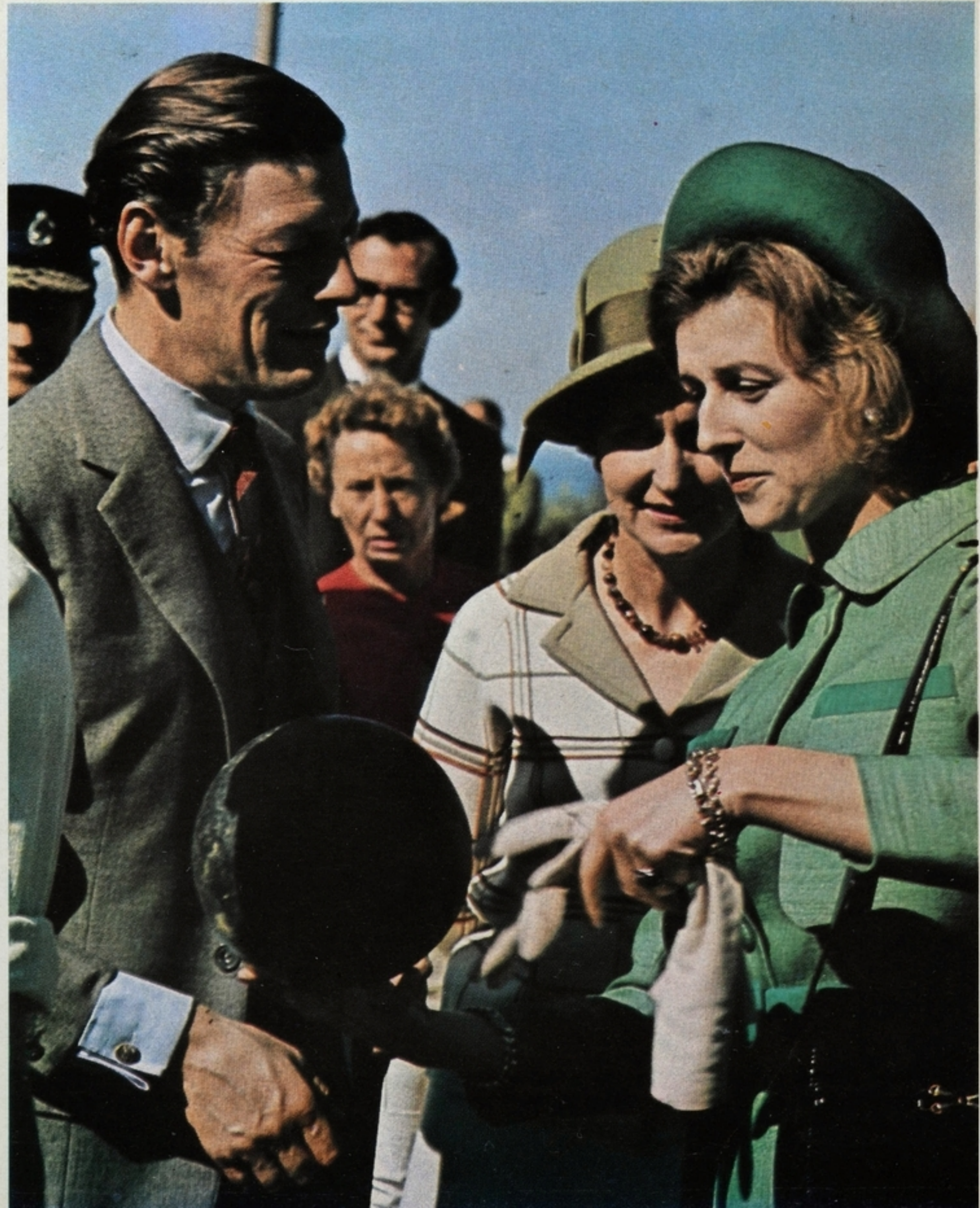
Below: Princess Alexandra feeling the grip and the weight of the tenpin bowl after her husband had demonstrated his skill on the green.