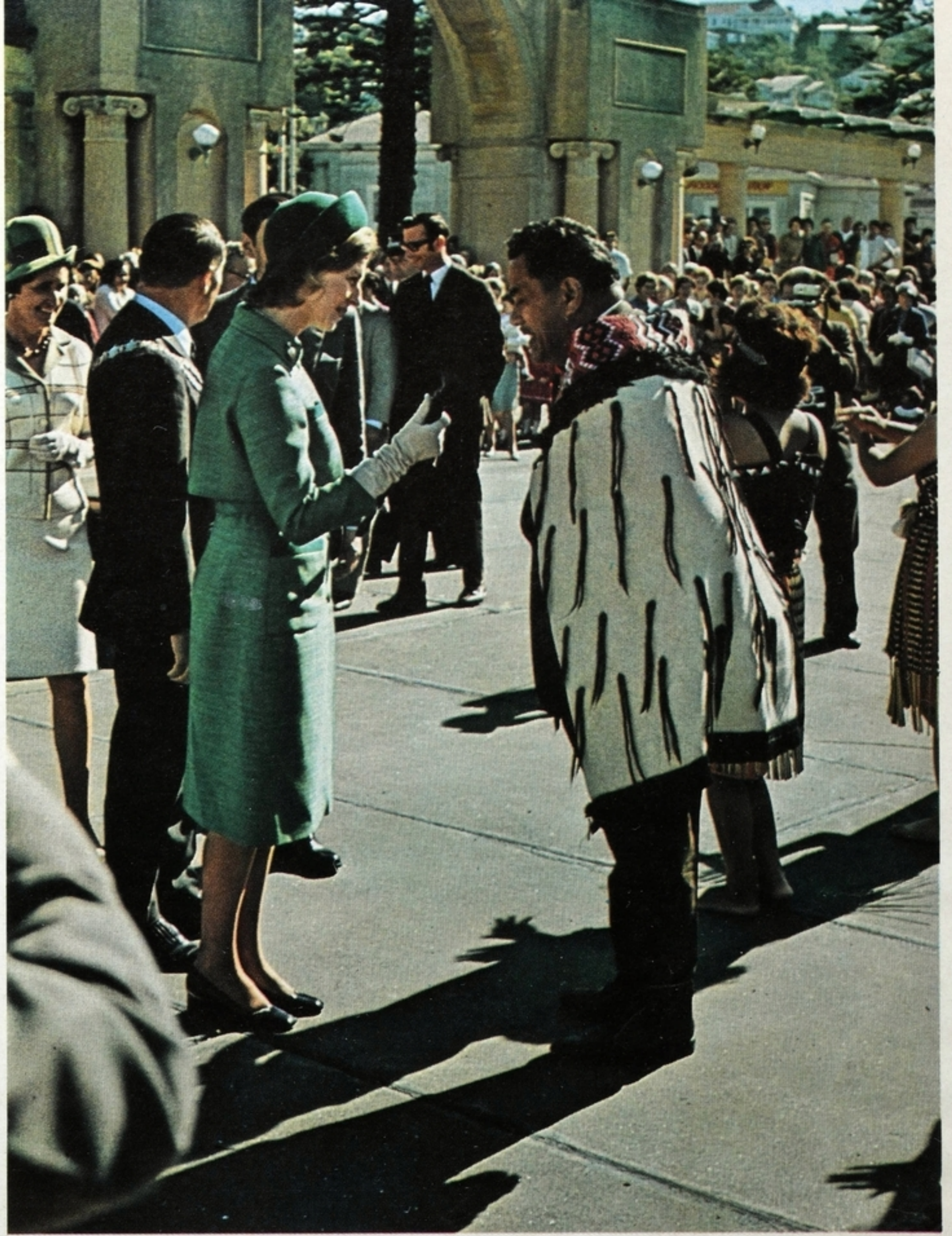
Above: The Princess meeting Maoris who took part in the Maori welcome at the Sound Shell on the Marine Parade.